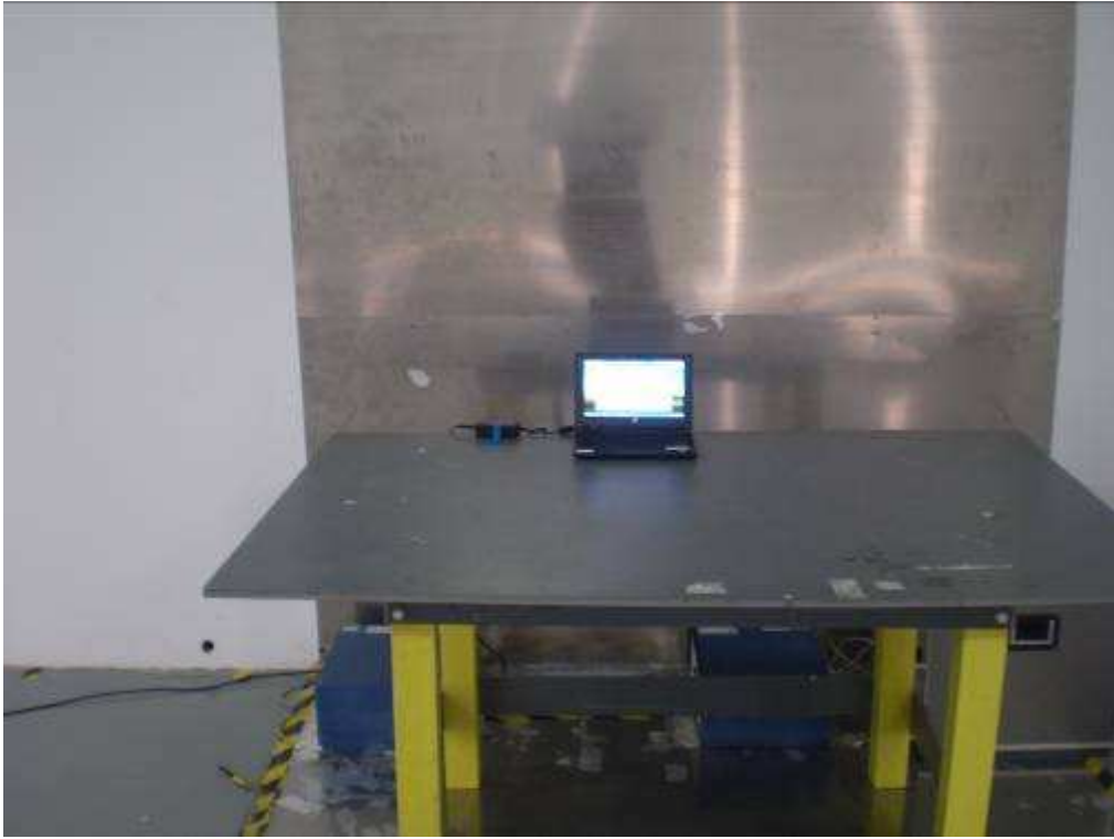
Conducted Emission Front View