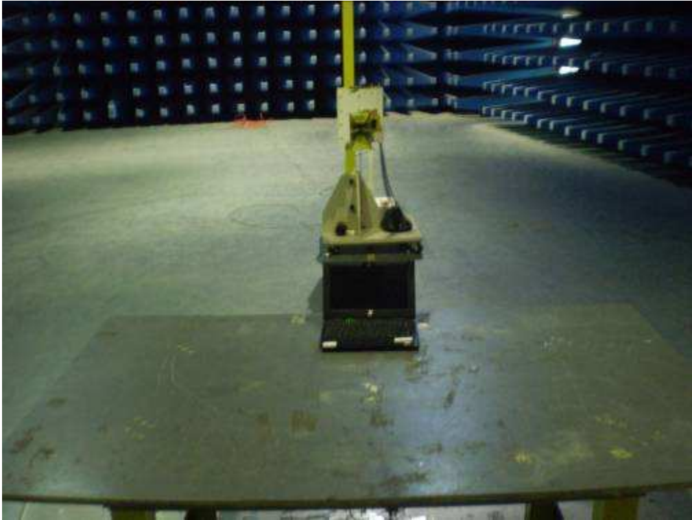
Radiated Emission Front View above 1GHz