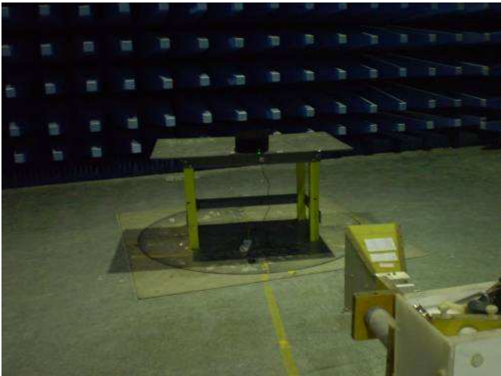
Radiated Emission Rear View above 1GHz