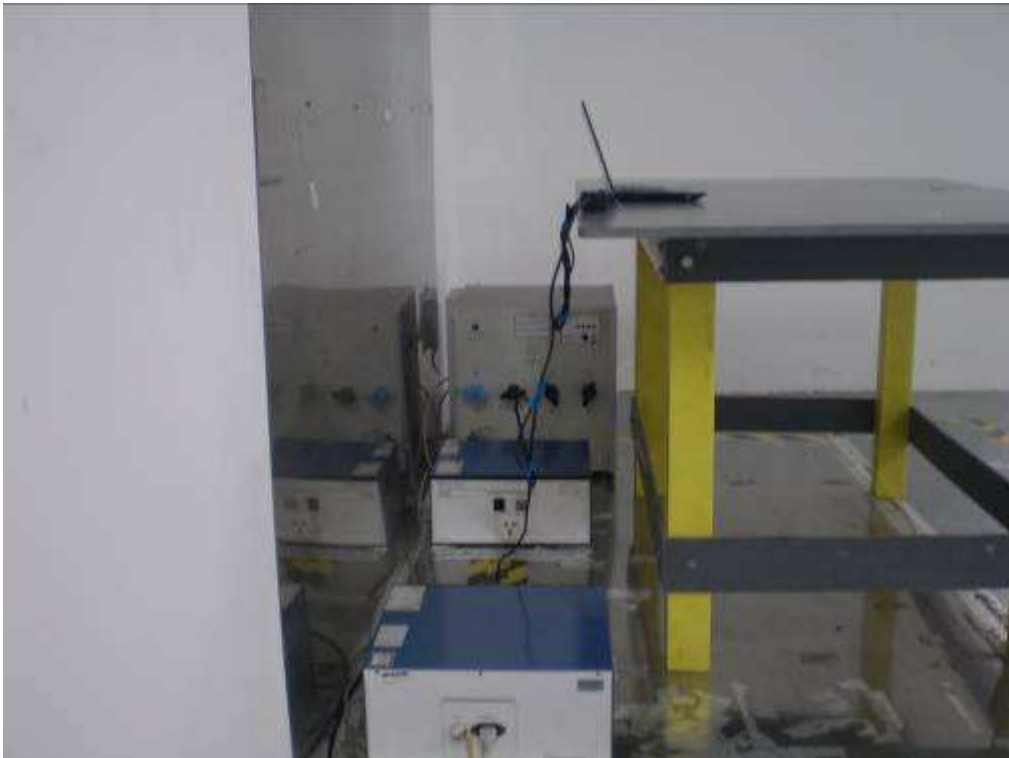
Conducted Emission Side View