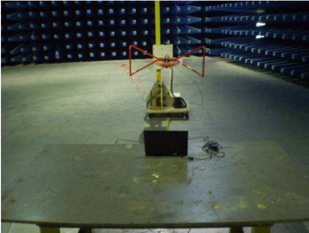
Radiated Emission Rear View below 1GHz