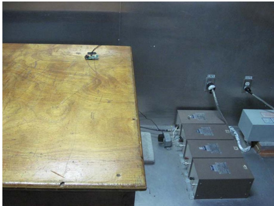
PHOTOGRAPH SHOWING THE EUT CONFIGURATION FOR CONDUCTED EMISSIONS