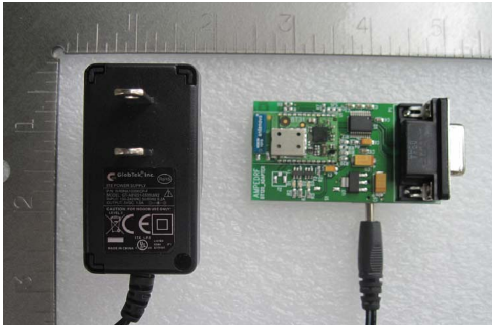
EUT on supported PCB, showing AC adapter

1547 Plymouth Street, Mountain View, CA 94043 Tel: (650) 965-4000 Fax: (650) 965-3000