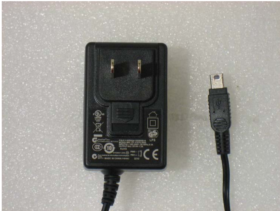
AC adapter, 100-240 VAC / 5 VDC out