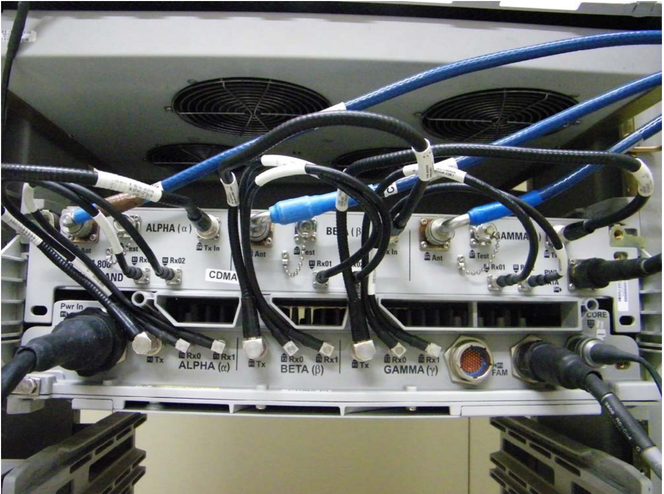
MFRM3 Assembly Front View Fan Assembly Removed