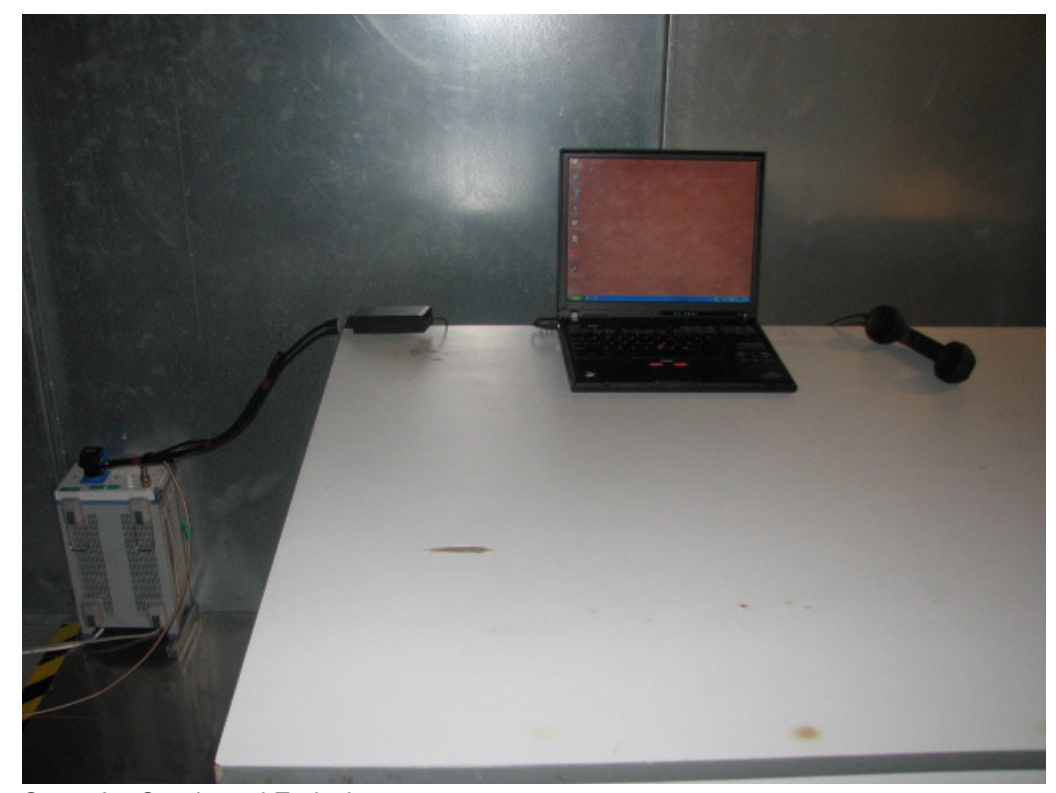
Setup for Conducted Emission