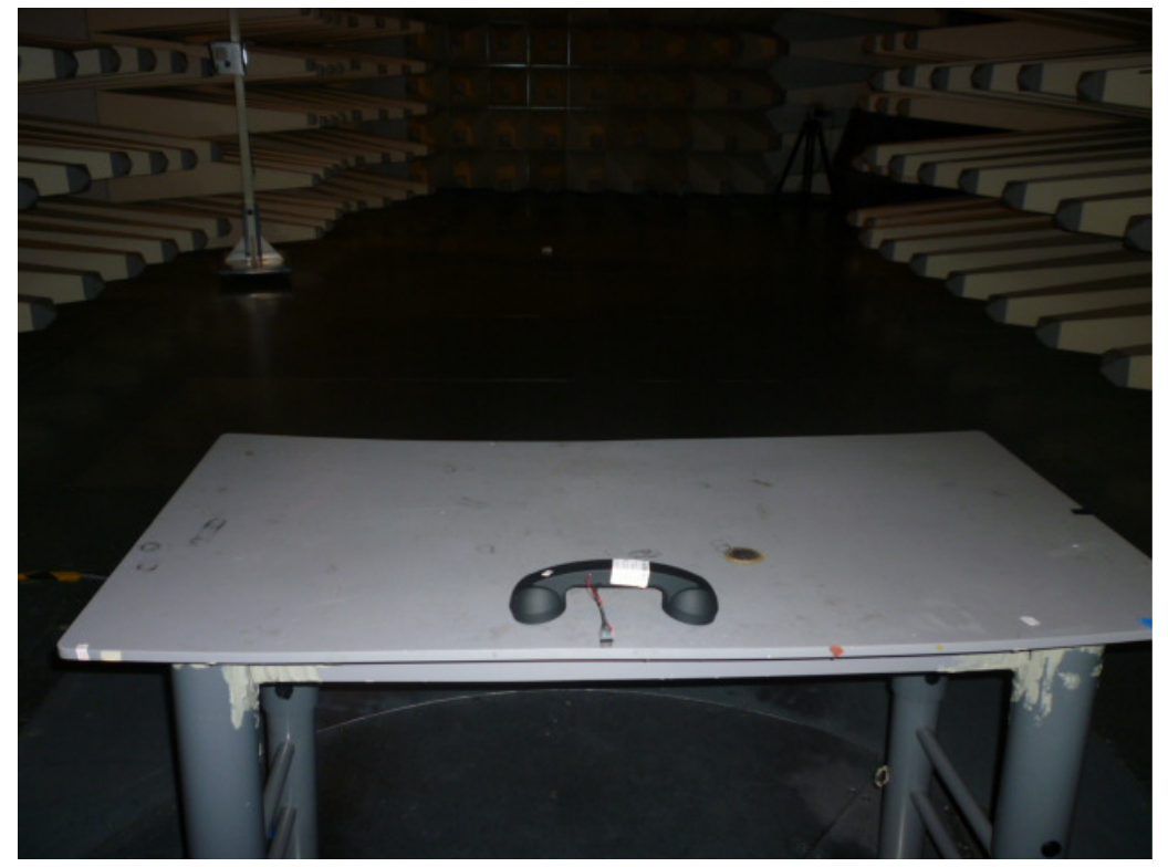
Setup for Radiated Emission