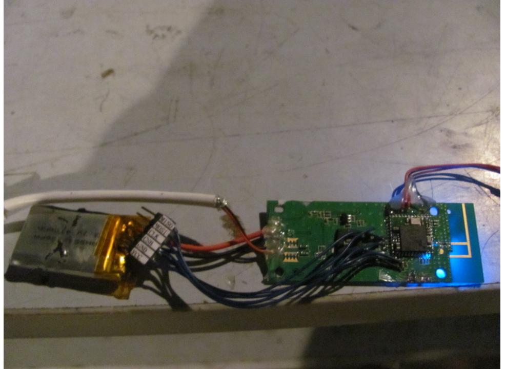
Set-up for Radiation Emission (Transceiver)