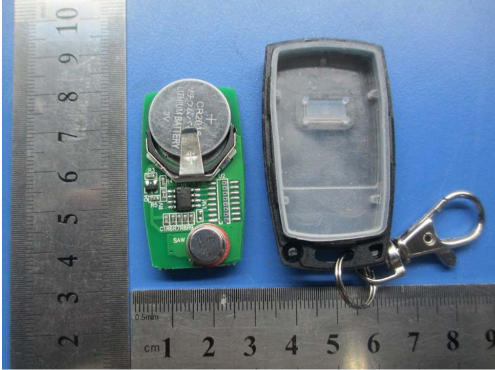
EUT (Transmitter) – Uncover Front View