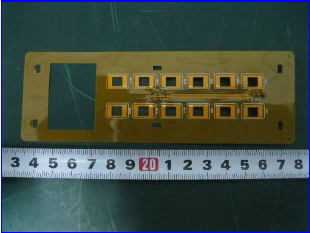
Rear View of Keyboard PCB Board