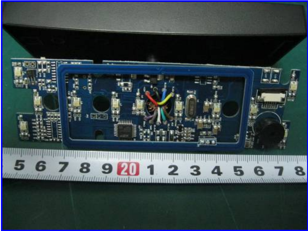
Front View of Main PCB Board