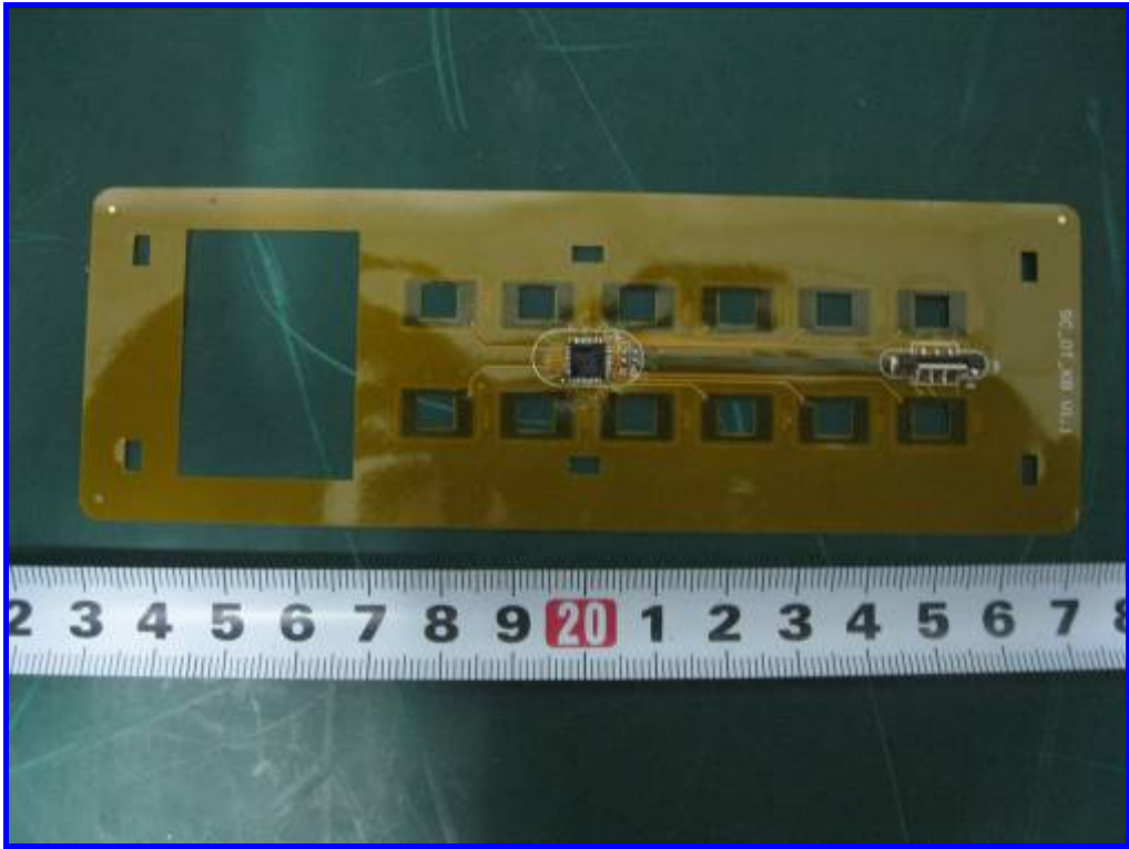
Front View of Keyboard PCB Board