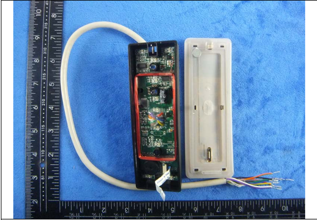
EUT – Uncover Front View 1