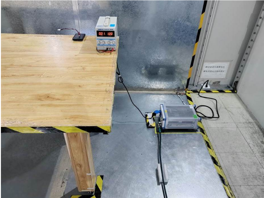
Conducted Emissions (Left View)