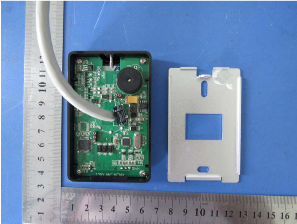
Uncover- Front View