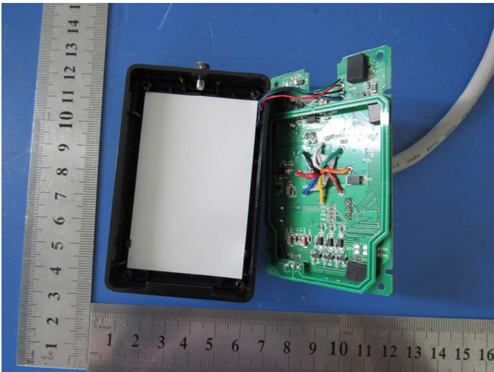
Uncover- Rear View