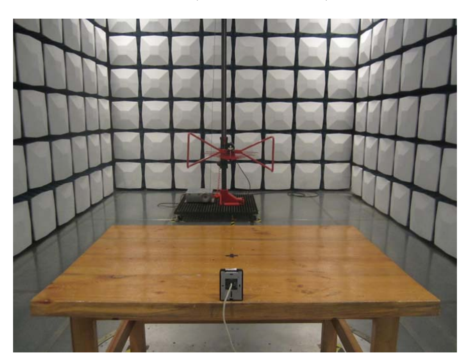
Radiated Emission (30 MHz-1000 MHz) - Rear View