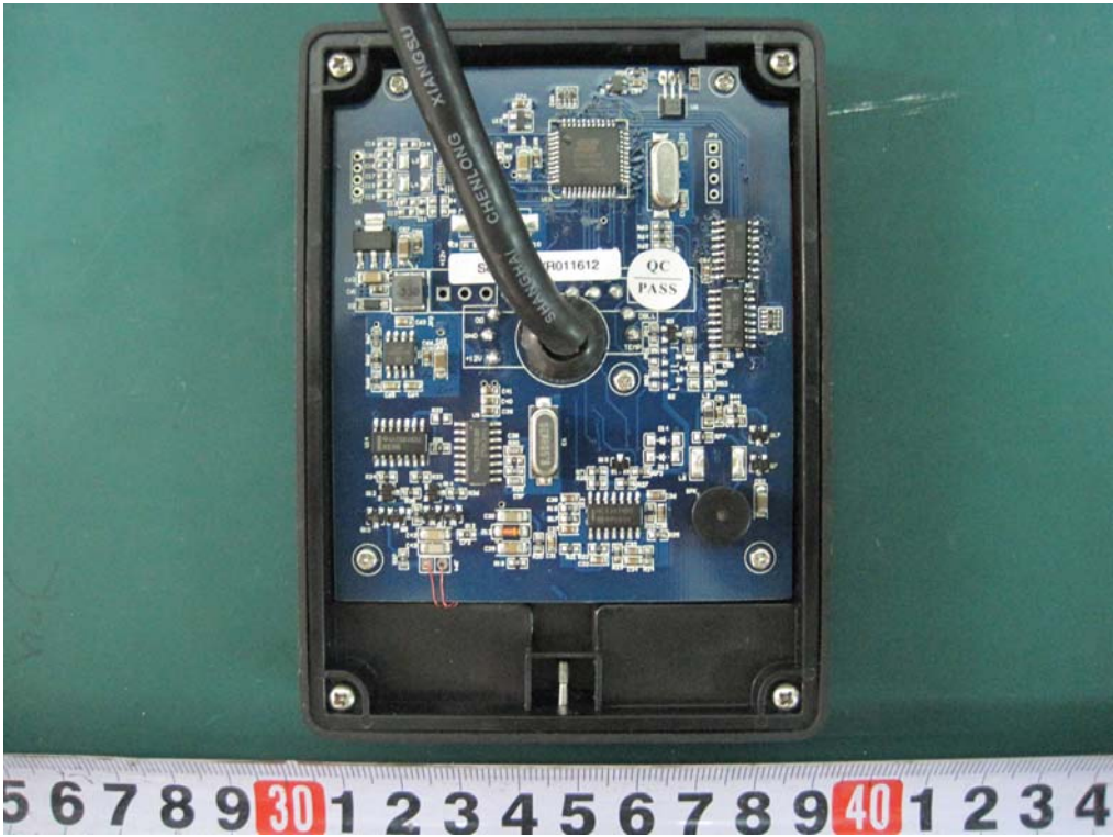
Main Board Top View