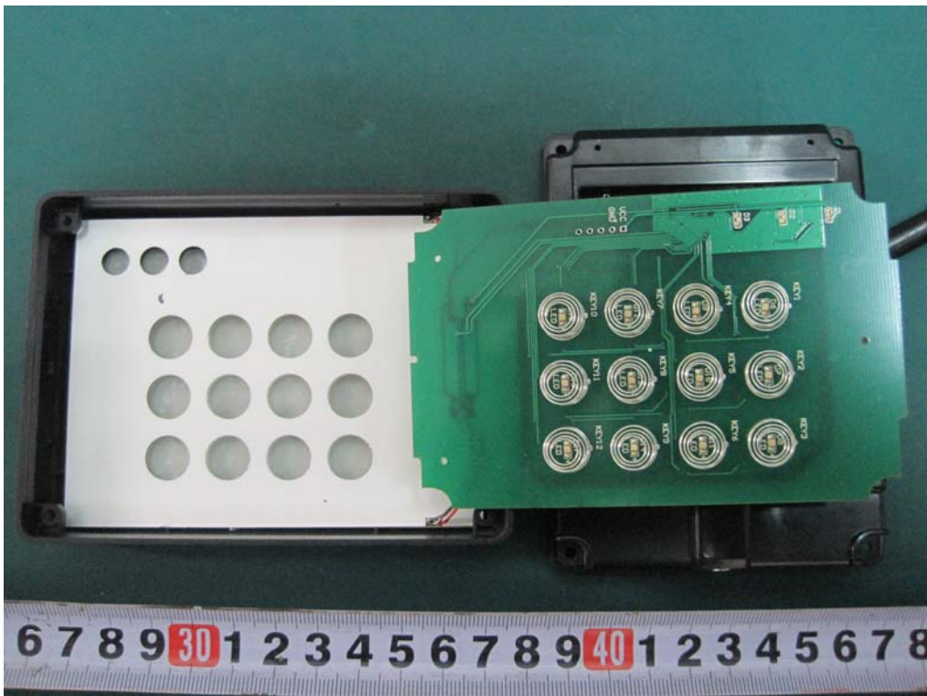
Key Board Top View