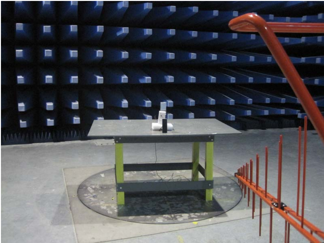
Radiated Emissions Test Set-up Front View