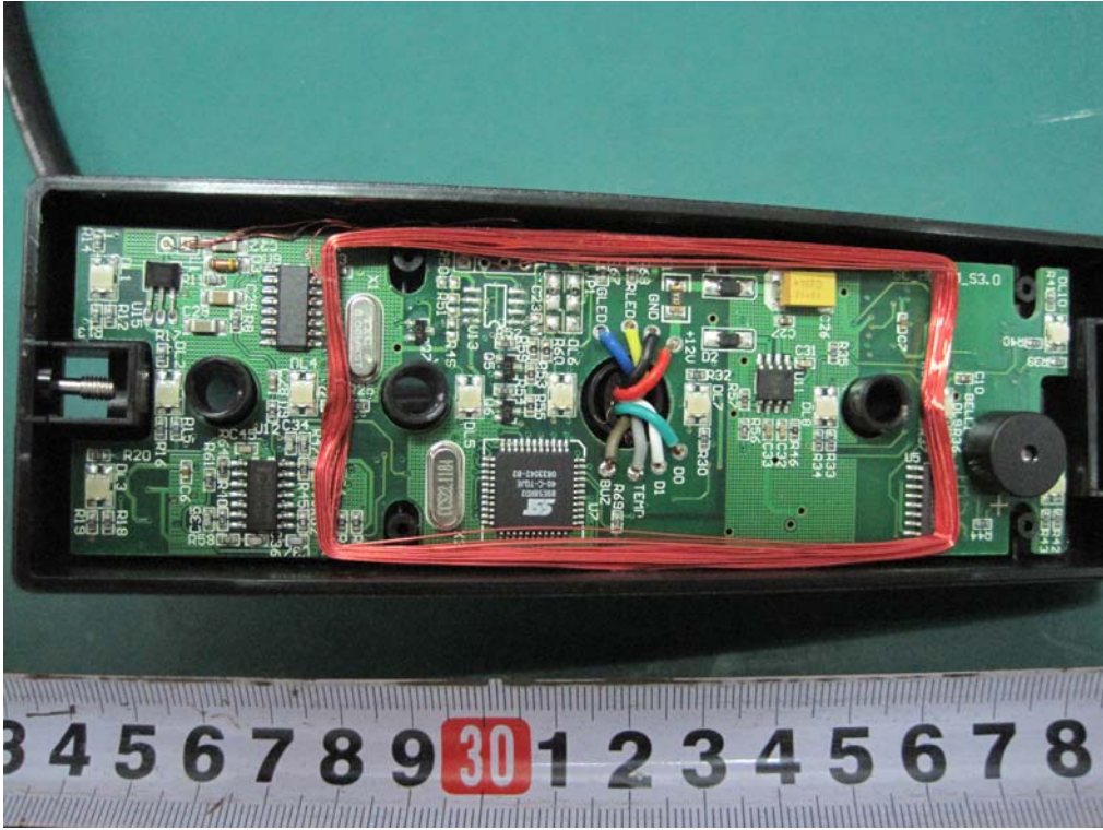
Main Board Top View