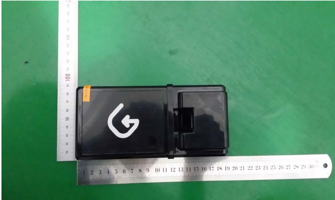
EUT – Bottom View