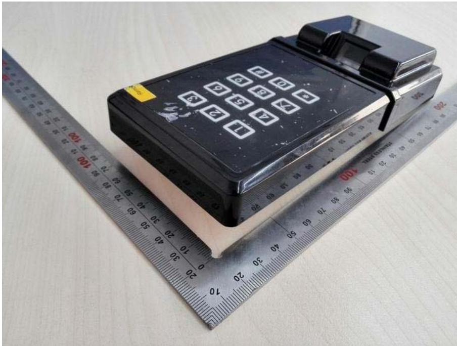
EUT – Right Side View