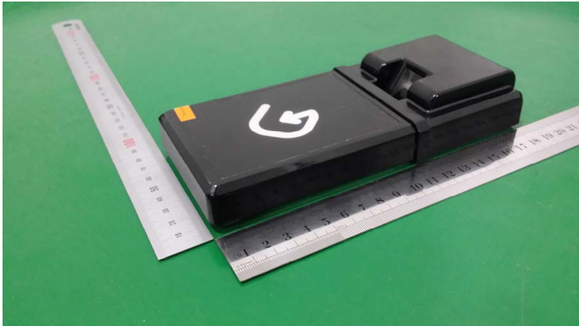
EUT – Right Side View