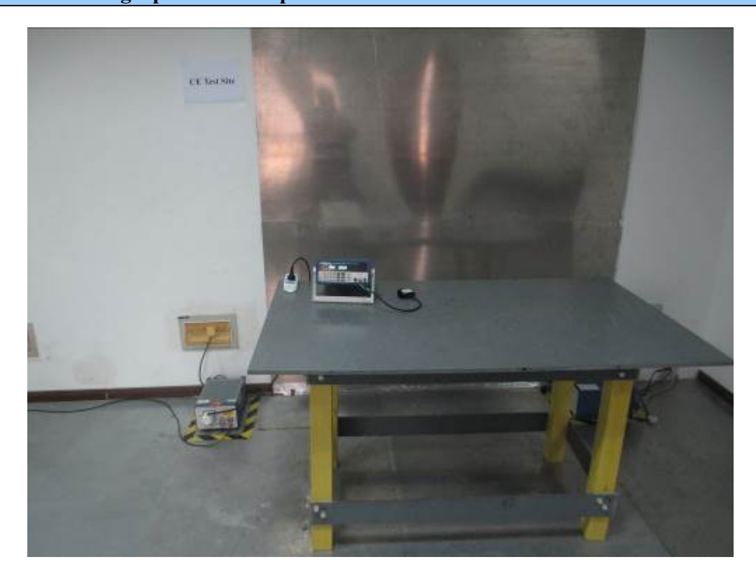
Conducted Emission Test Setup Front View