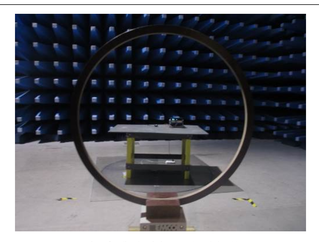
Front View of Radiated Emissions Test Setup below 30MHz

13020915-FCC-R1 December 11, 2013 31 of 37 www.siemic.com