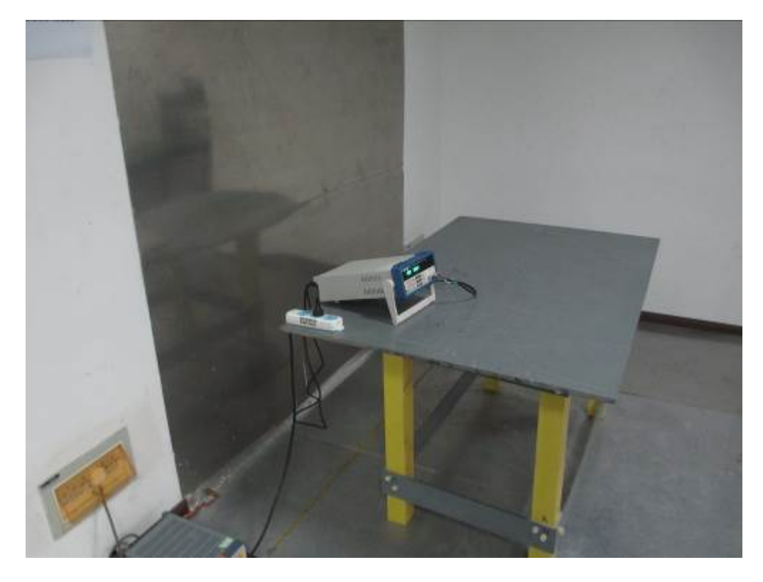
Conducted Emission Test Setup Side View