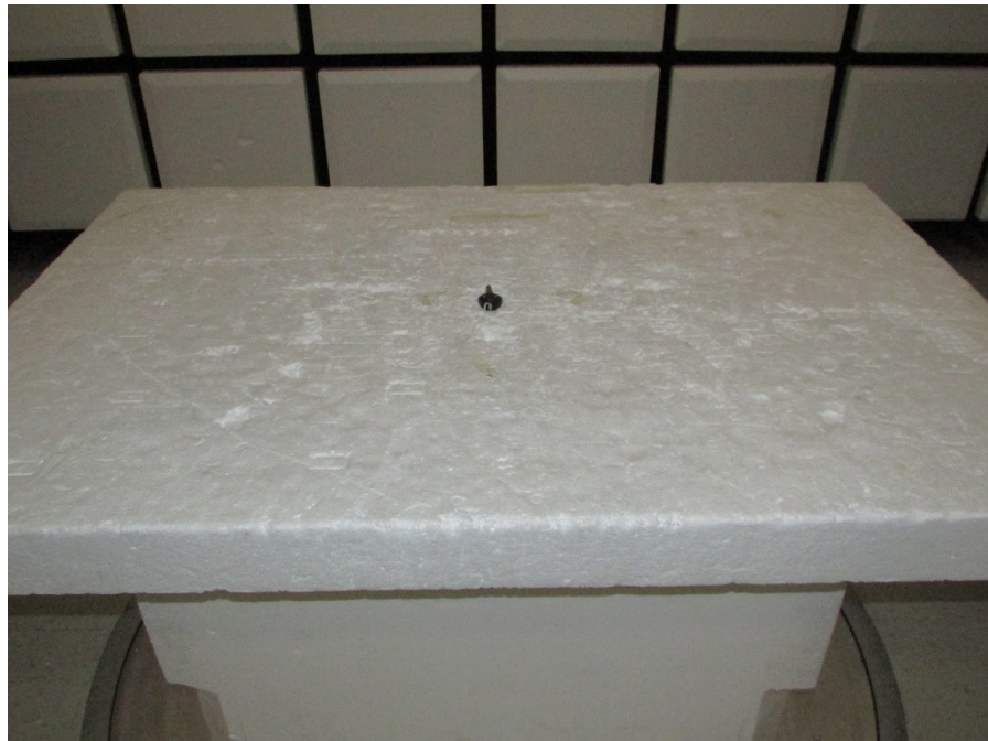
Figure 1: Radiated Emissions – Front - XPOS – Below 1GHz