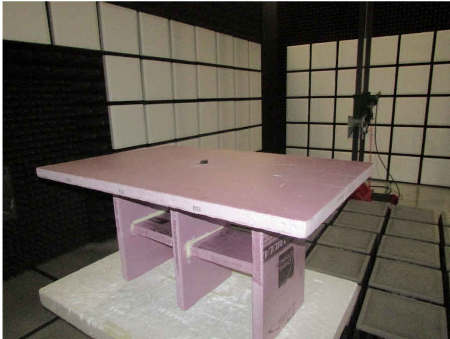
Figure 3: Radiated Emissions – Back – XPOS – Above 1GHz