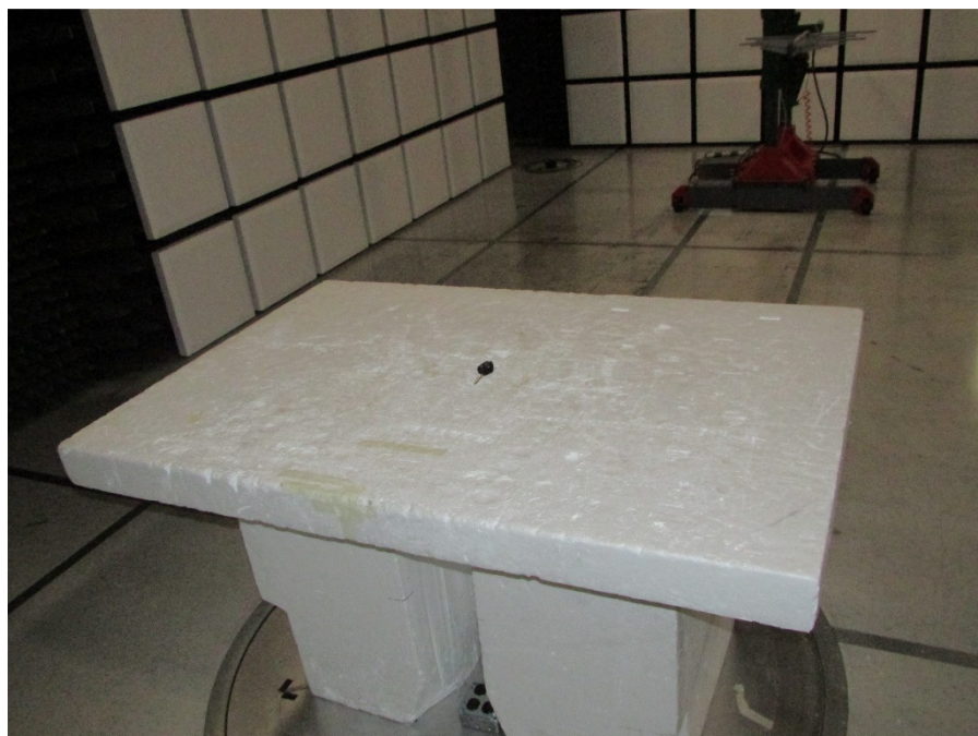
Figure 2: Radiated Emissions – Back - XPOS – Below 1GHz