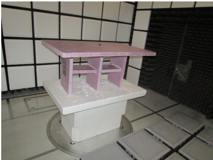
Figure 4: Radiated Emissions – Front – XPOS – Above 1GHz