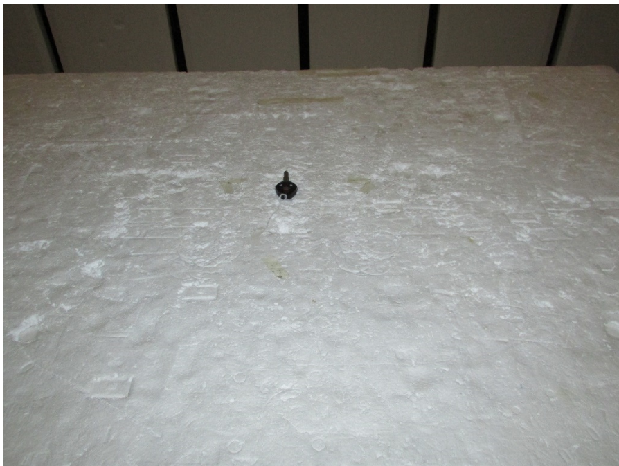
Figure 6: Radiated Emissions – XPOS