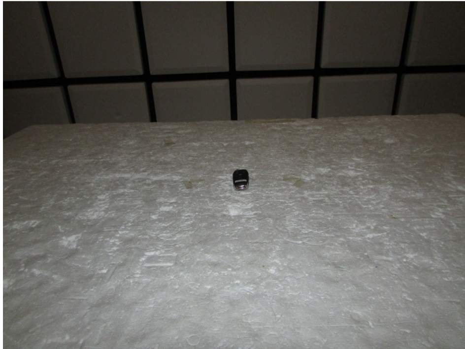
Figure 1: Radiated Emissions – Front - XPOS – Below 1GHz