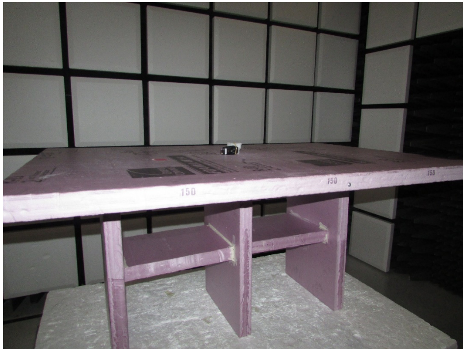
Figure 5: Radiated Emissions – ZPOS