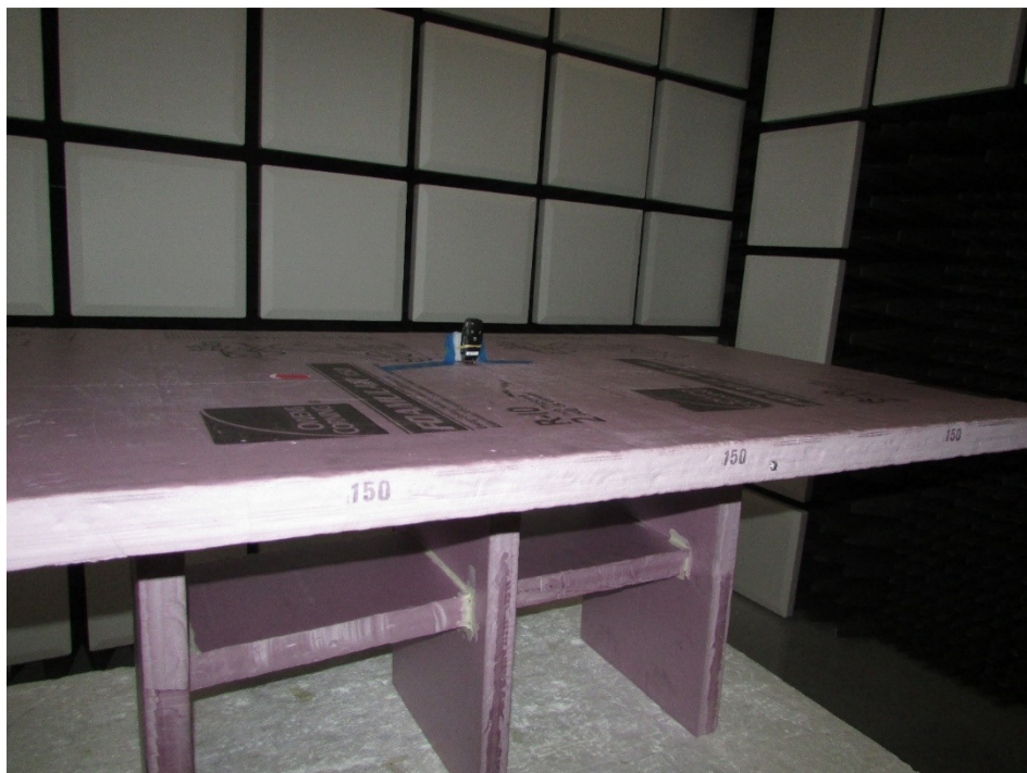
Figure 7: Radiated Emissions – YPOS