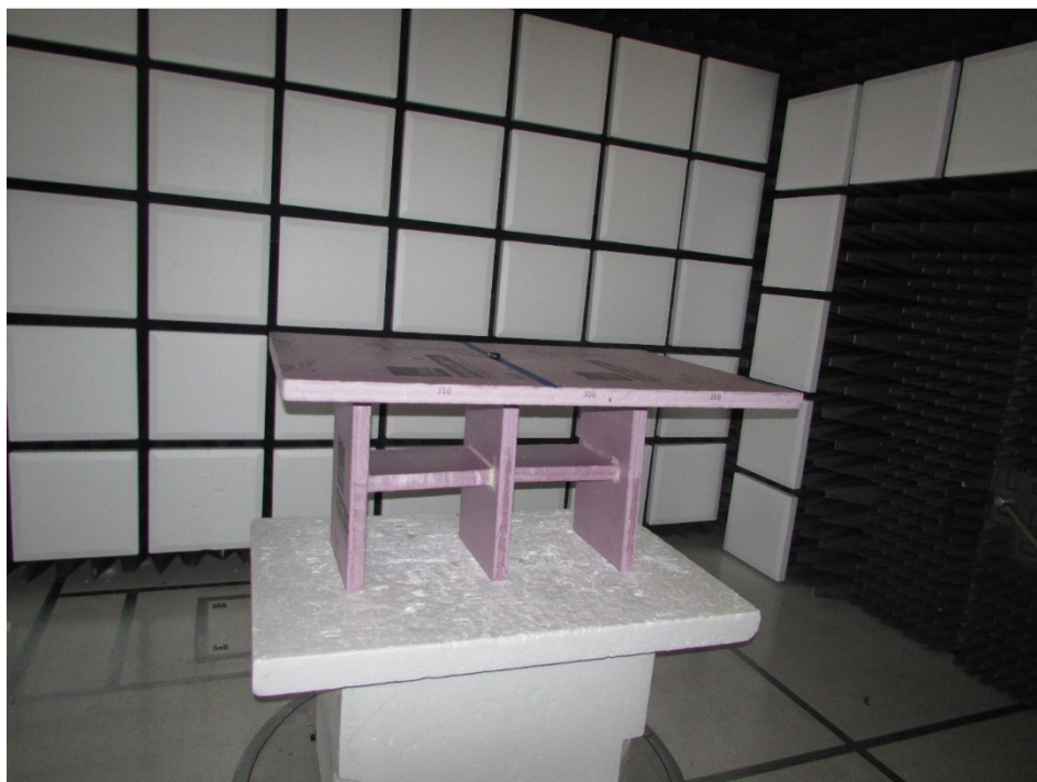
Figure 4: Radiated Emissions – Front – XPOS – Above 1GHz