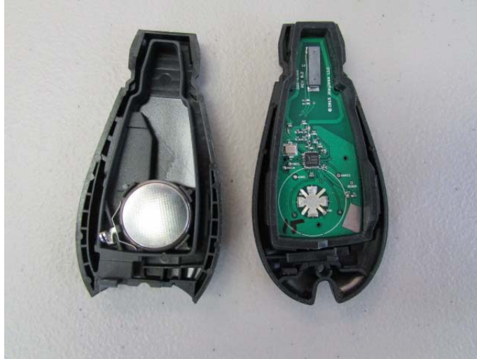
Figure 1: Internal