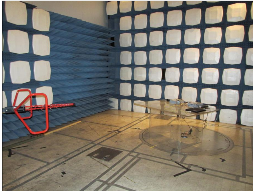
Photograph 1. Radiated Emissions, Test Setup, Below 1 GHz