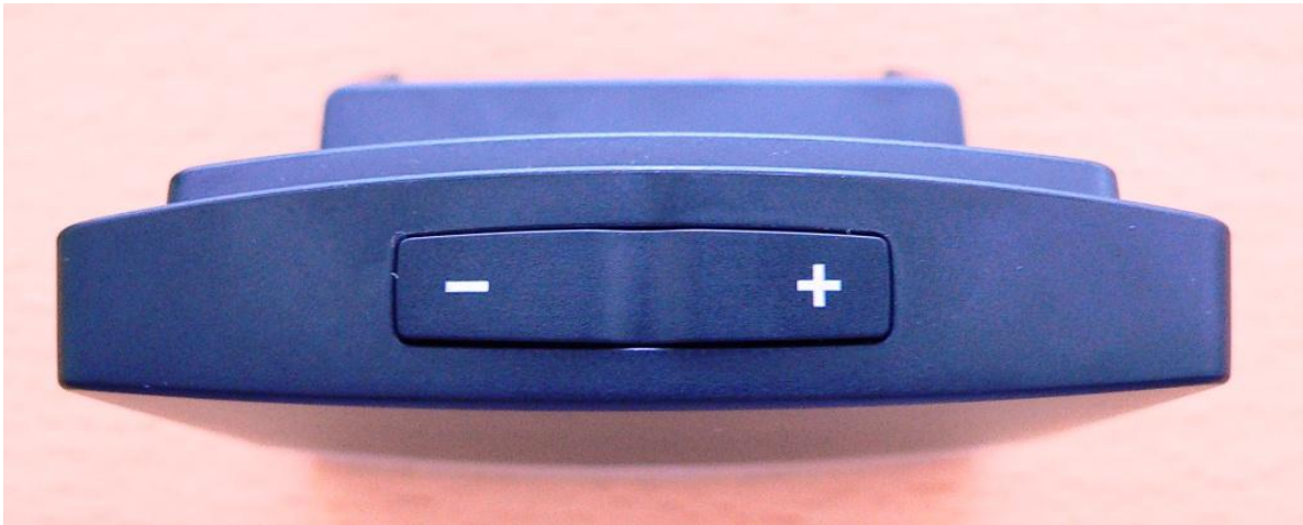
Top view (Volume up and down button)