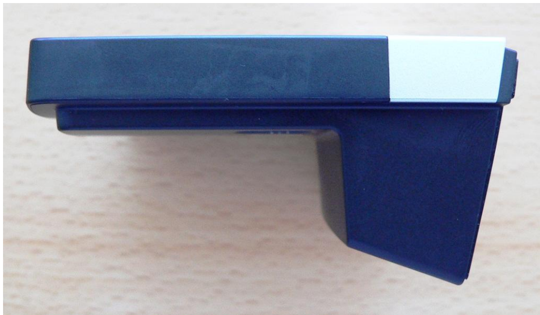
Left side (with respect to front view)