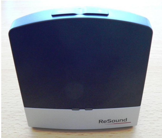
Front view, SAS-3 (standing on table.)