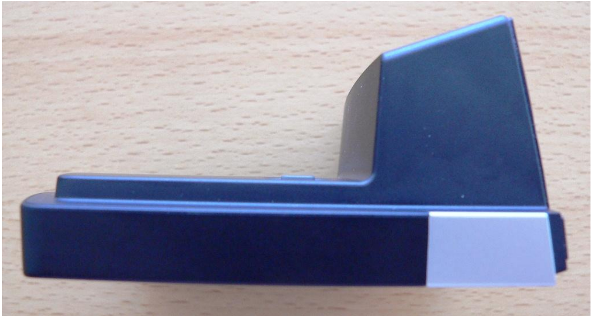
Right side (with respect to front view)