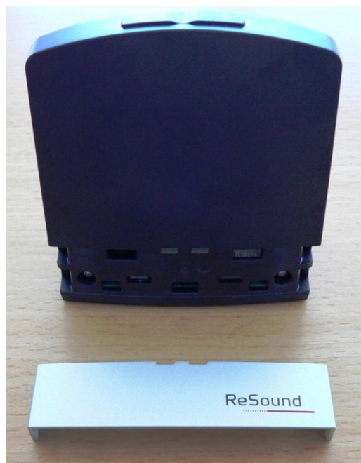
Front view, SAS-3 (DECO cover removed)