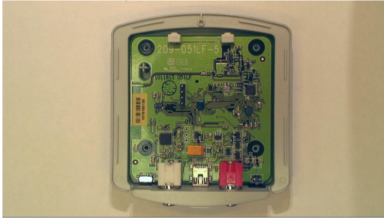
Electronics assembly with mechanics