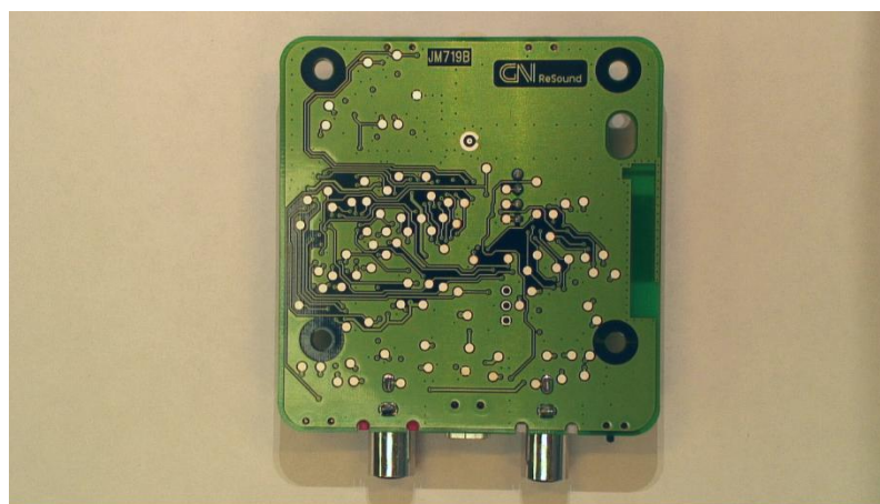
Electronics assembly back