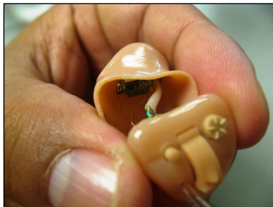
Inside of a finished device