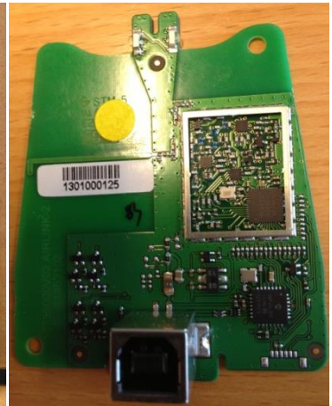
Back (without shield)