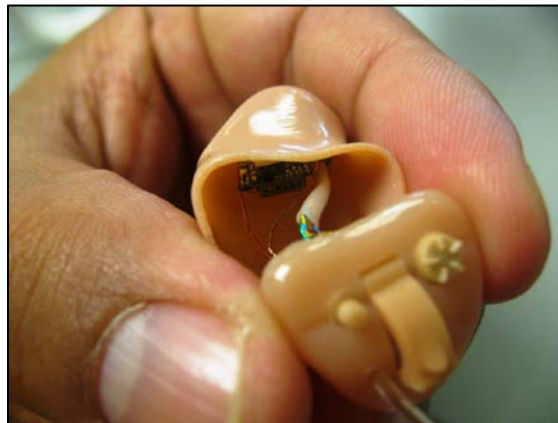
Inside of a finished device