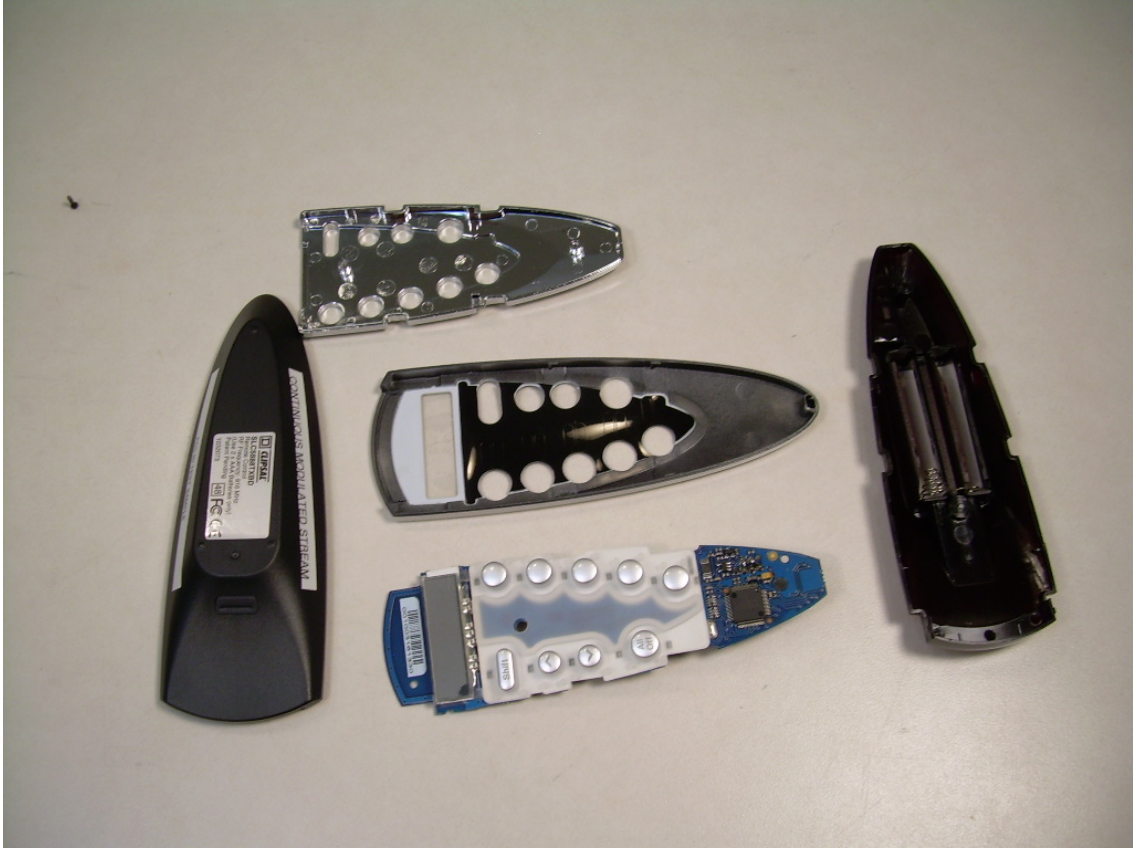
EUT with Covers and Housing Removed