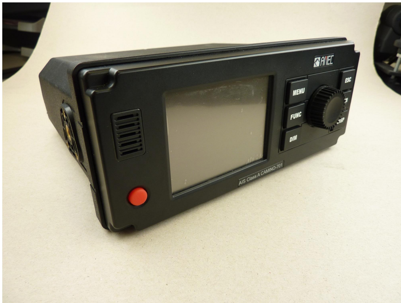
123924eut3.jpg: EUT, front view