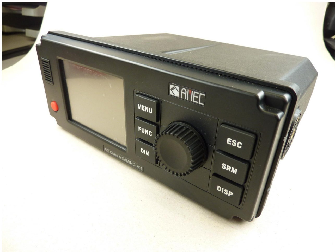
123924eut1.jpg: EUT, 3D-front view