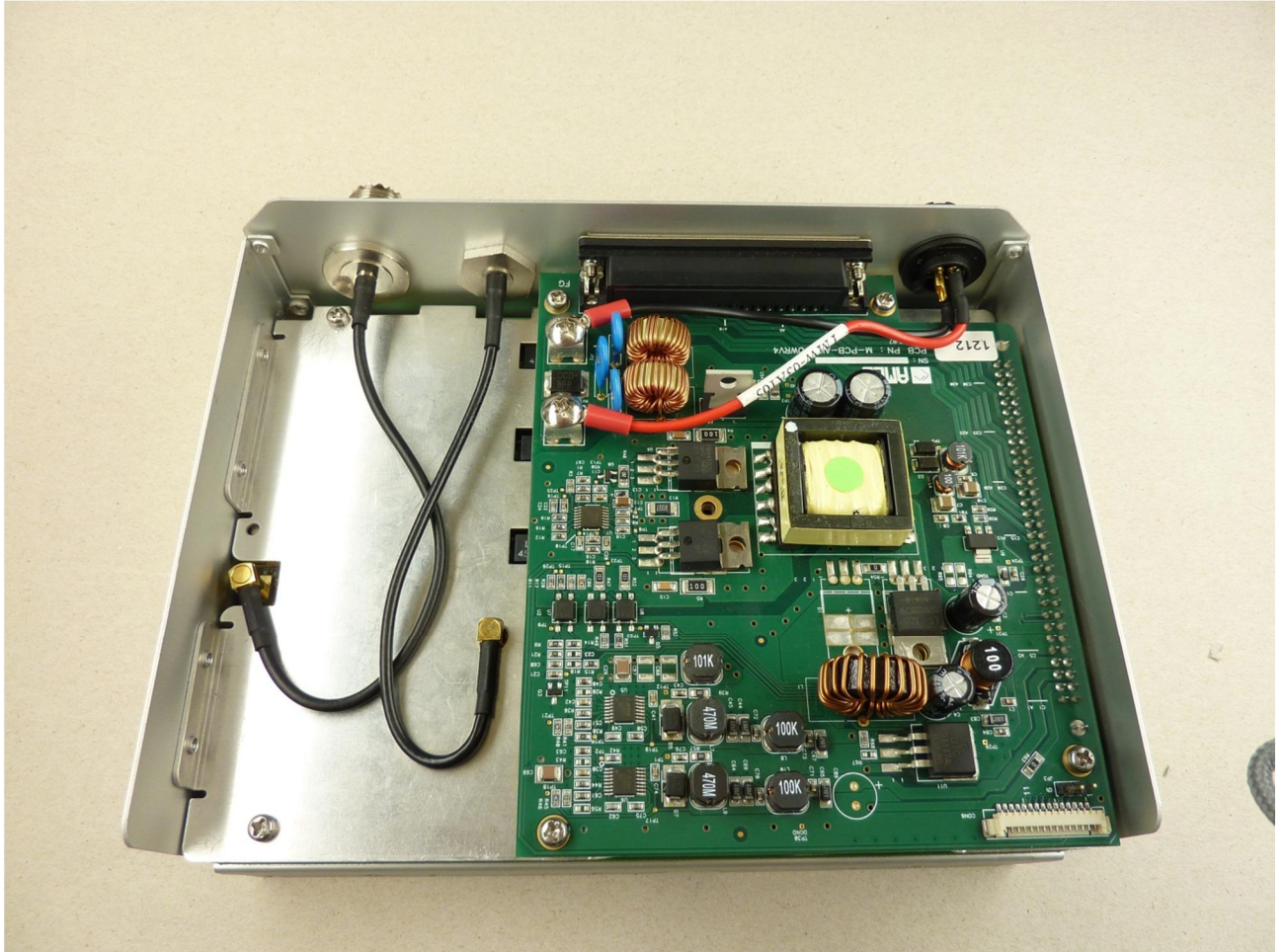
123924eut5.jpg: EUT, inside view