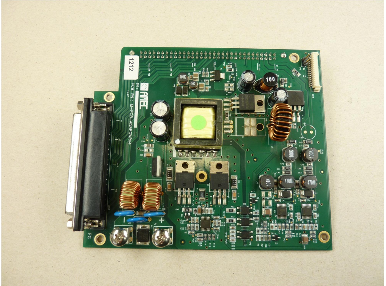
123924eut8.jpg: Main-PCB, front view

Annex A: Picture annex to test report F123924E1 EUT: AIS-Class-A-Transponder CAMINO-701 Manufacturer: Alltek Marine Electronics Corp