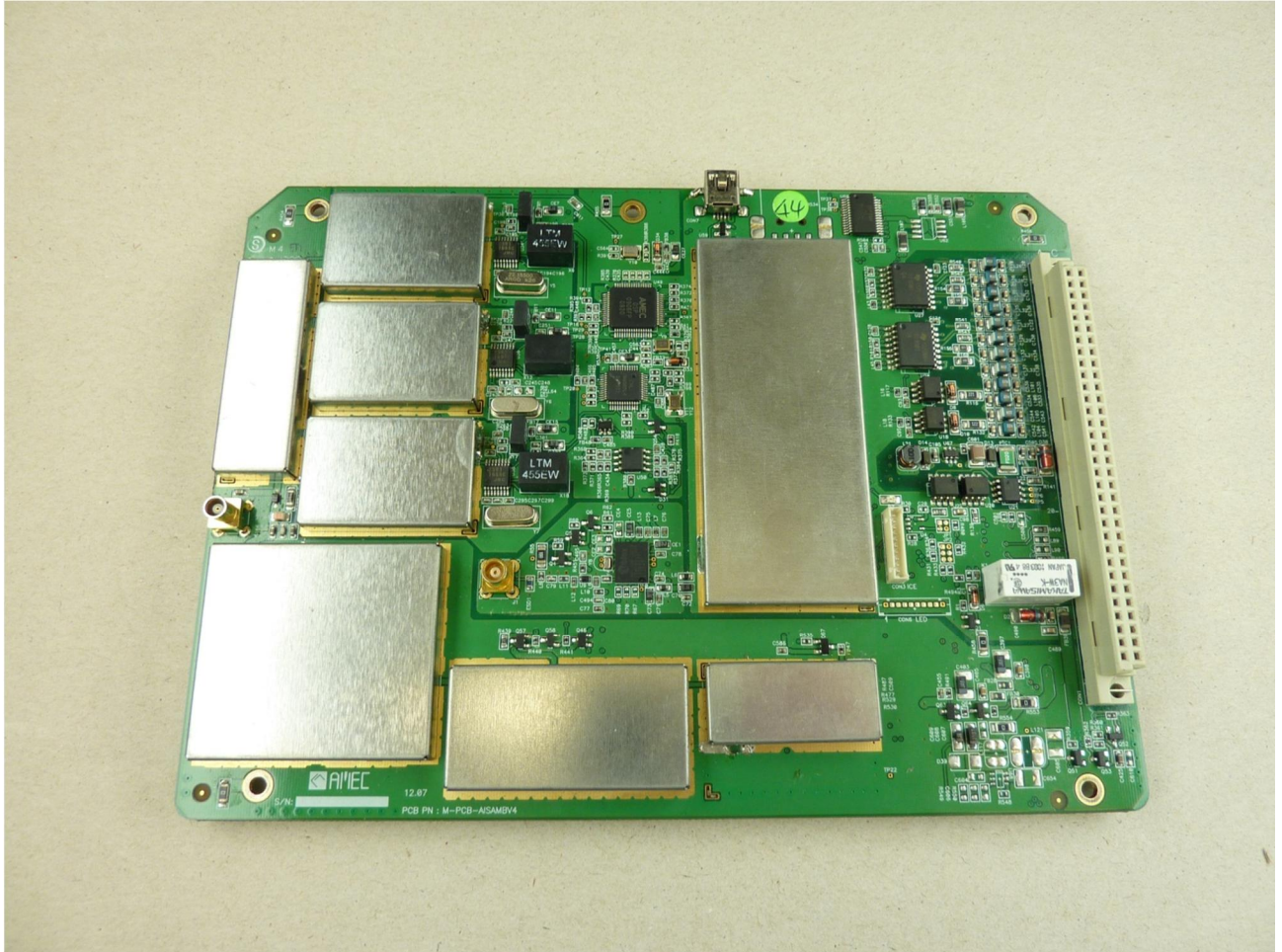
123924eut6.jpg: RF-PCB, front view

Annex A: Picture annex to test report F123924E1 EUT: AIS-Class-A-Transponder CAMINO-701 Manufacturer: Alltek Marine Electronics Corp