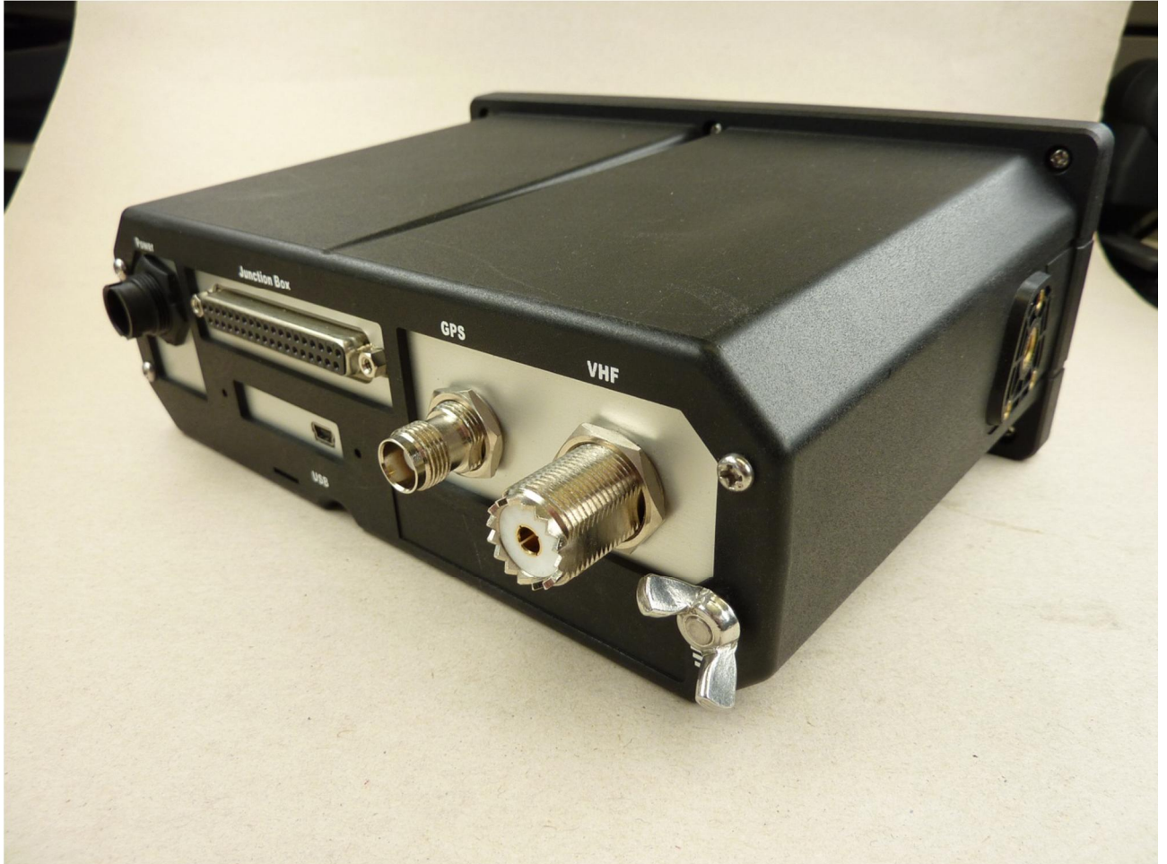
123924eut2.jpg: EUT, 3D-rear view