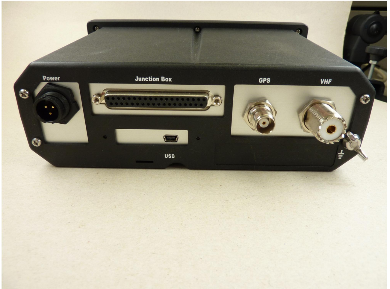
123924eut4.jpg: EUT, rear view