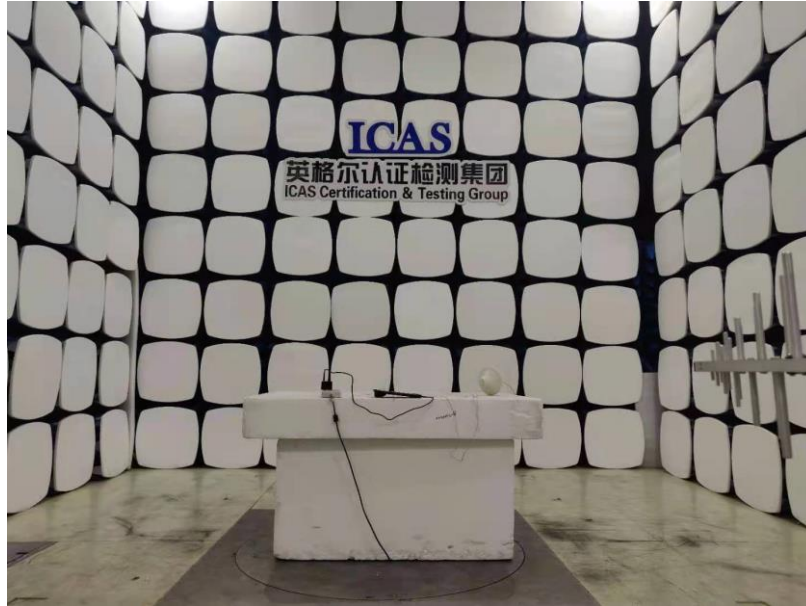
Below 1 GHz