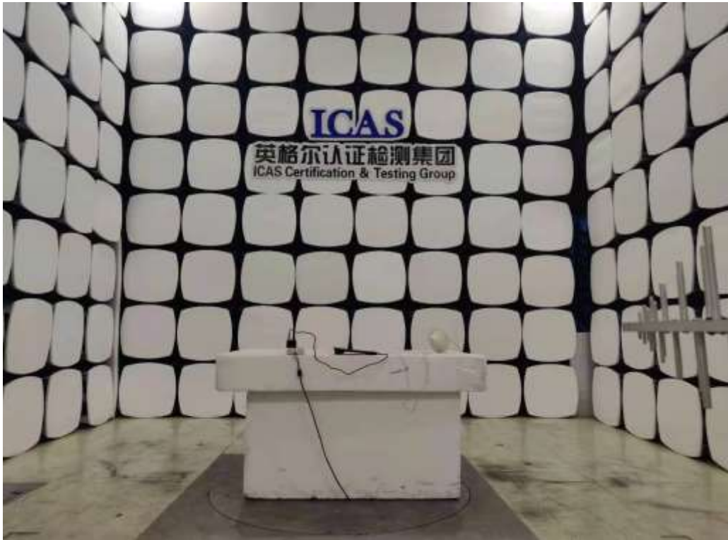
Below 1 GHz