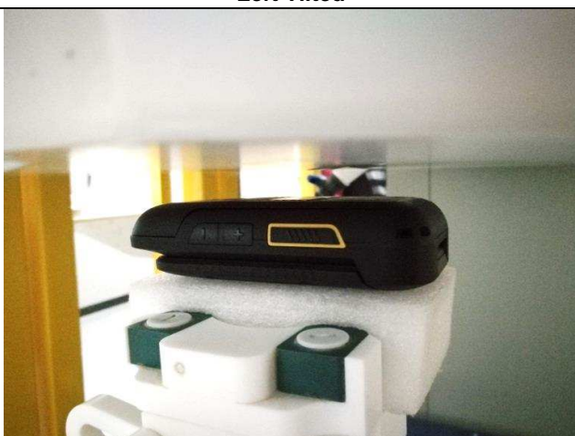
Rear Face of EUT with 1.0 cm Gap