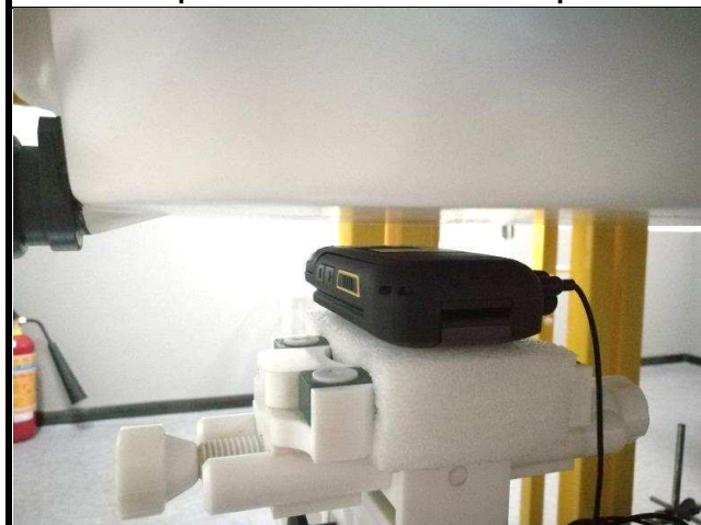
Rear Face with 1.0 cm Gap and Earphone