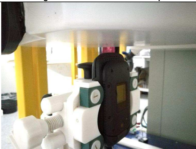
Bottom Side of EUT with 1.0 cm Gap