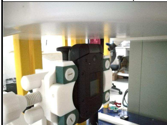
Top Side of EUT with 1.0 cm Gap