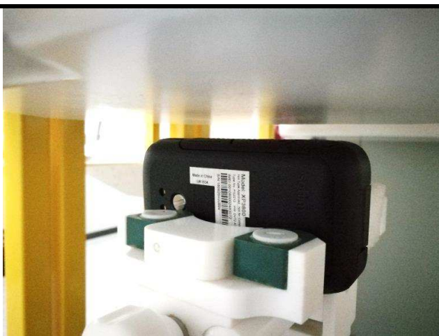
Right Side of EUT with 1.0 cm Gap