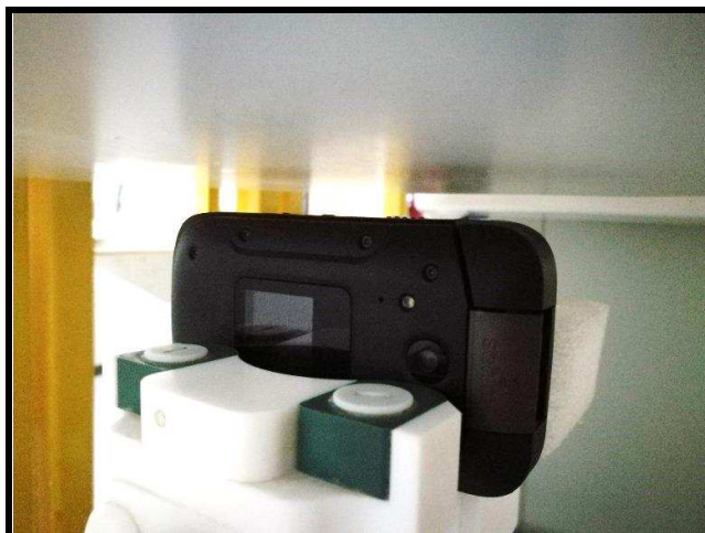
Left Side of EUT with 1.0 cm Gap