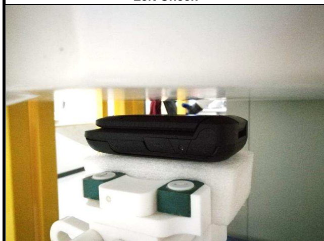
Front Face of EUT with 1.0 cm Gap