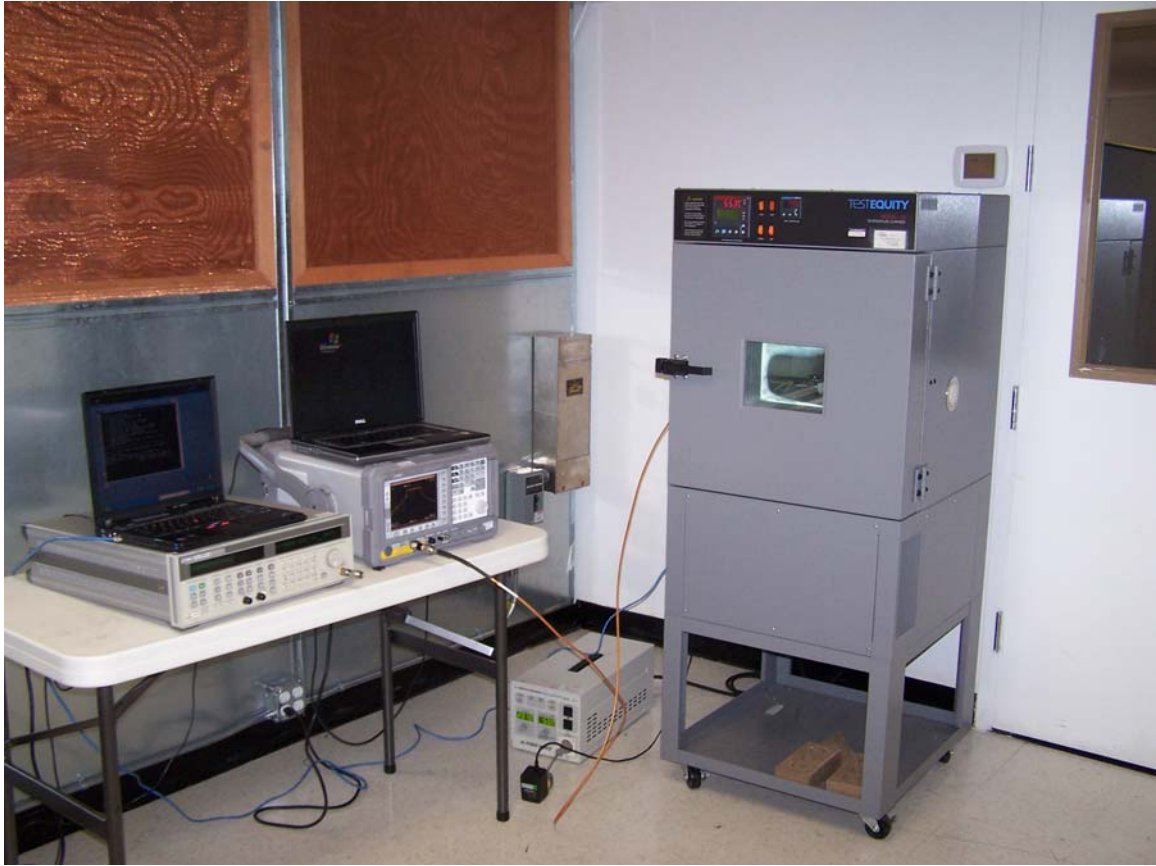
Photograph 4. Extreme test conditions