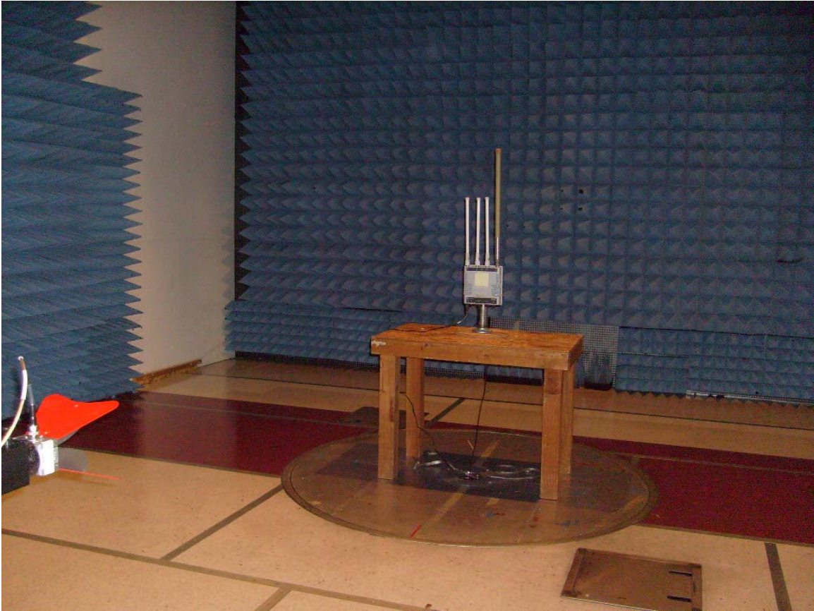
Photograph 3. Radiated Emissions, 1 GHz – 2 GHz