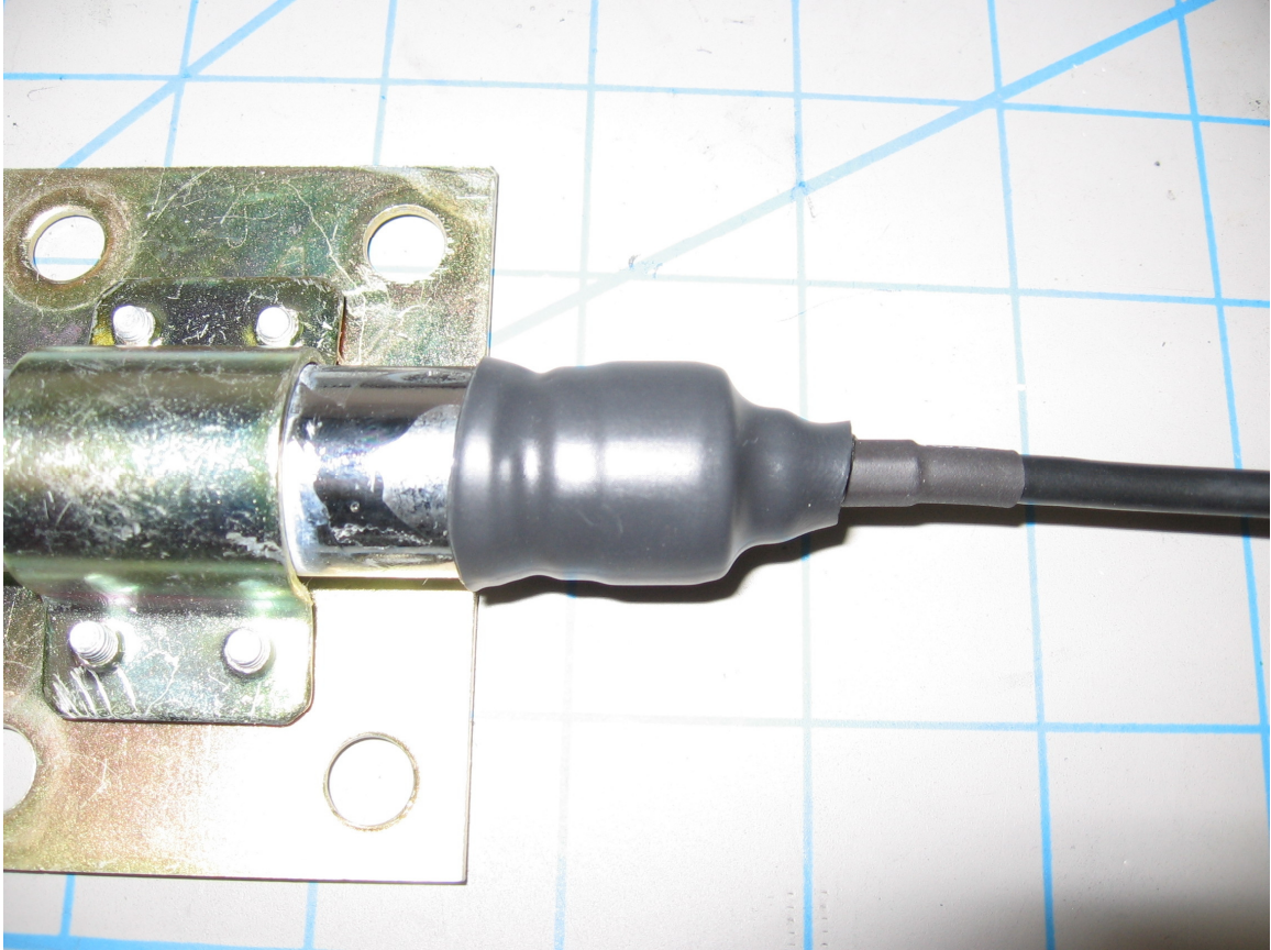
Shrink wrap connection for the omnidirectional antenna. For connectors seen in Photos 1 and 2 above.