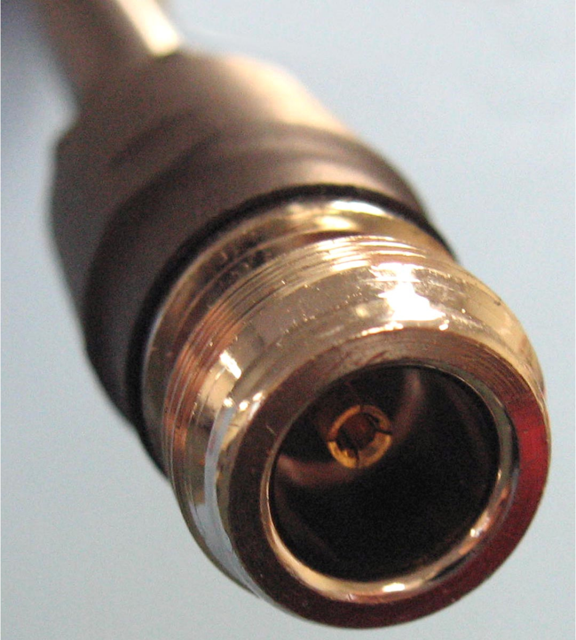
Female-N connector on the antennas.