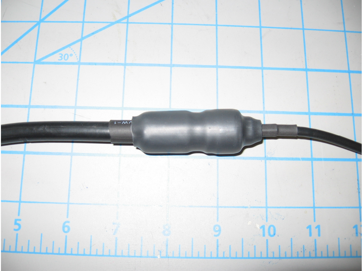
Shrink wrap connection for the directional grid antenna. For connectors seen in Photos 1 and 2 above.