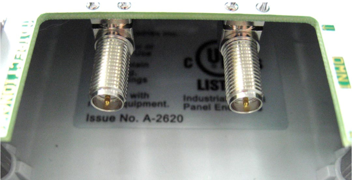
RP-SMA connector on the transmitter board.