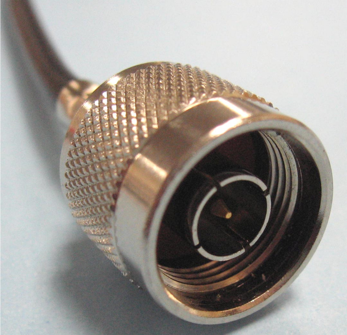
Adapter Cable for Female-N to RP-SMA. Male-N side of the connector is shown.