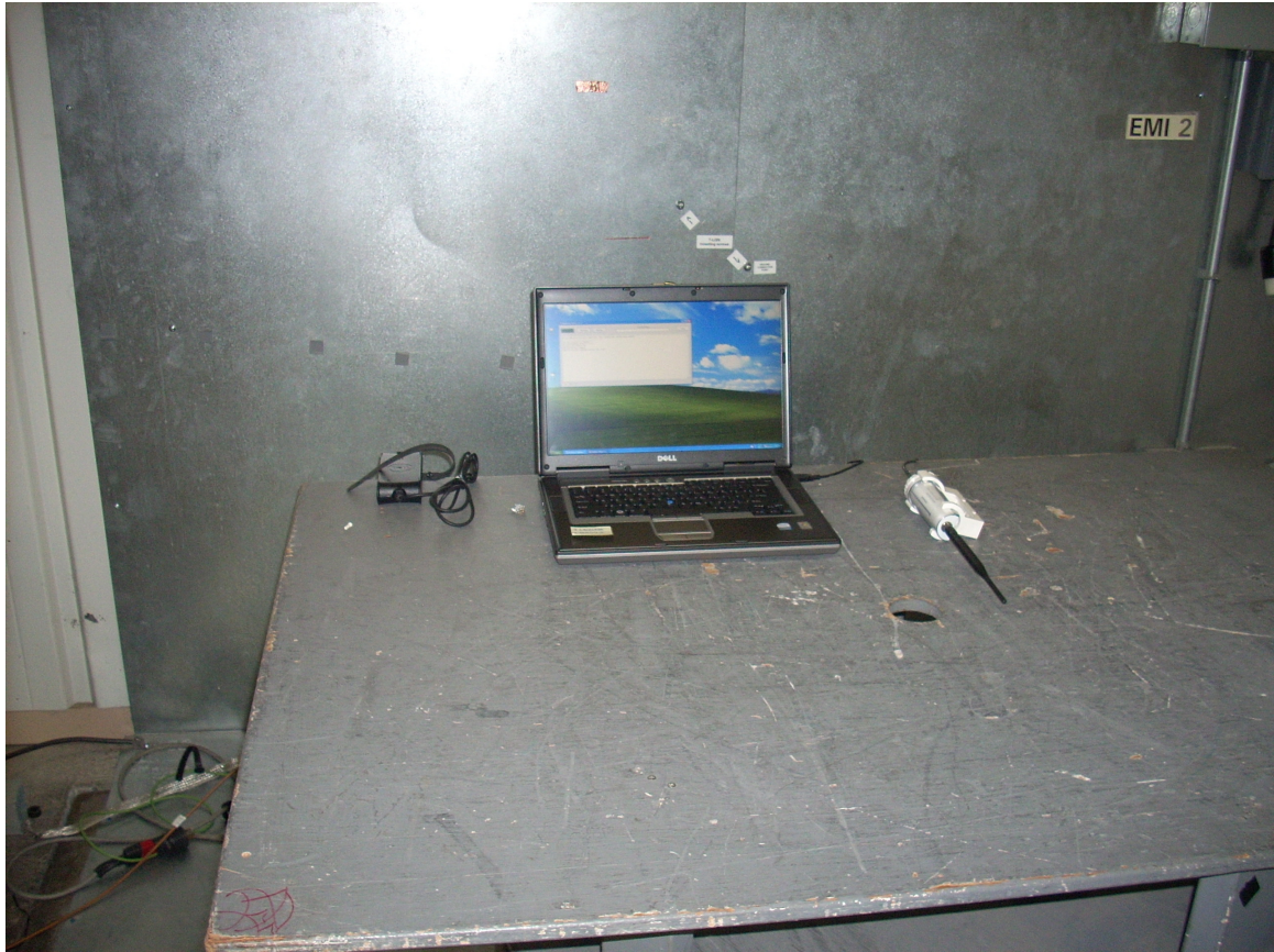
AC mains conducted emissions