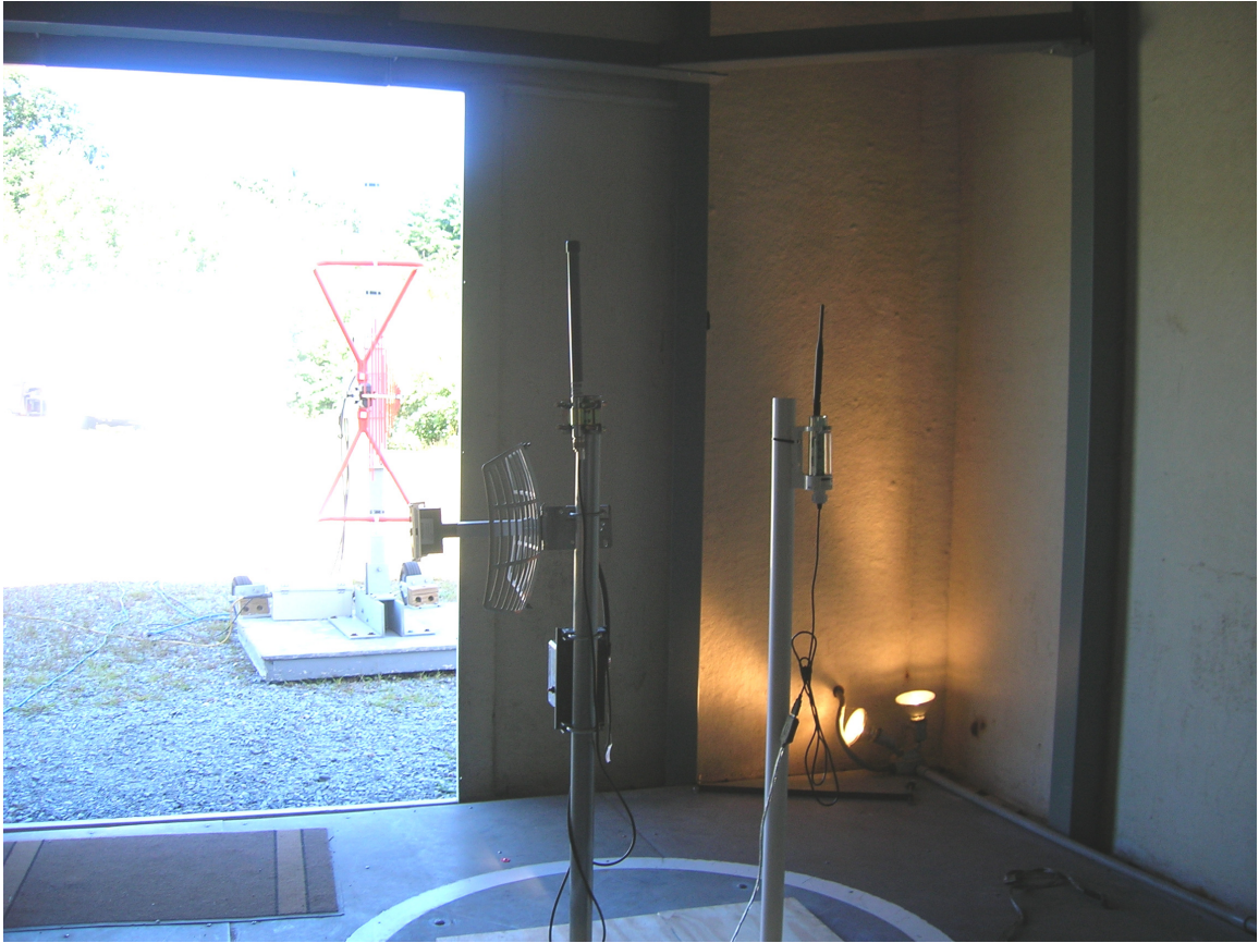
Repeater and Receiver