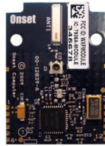
91-ZW-EM260 Installation Orientation