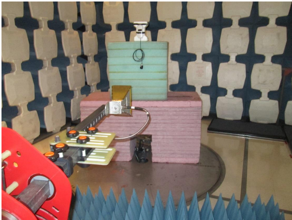
Radiated Emissions - 6 to 18 GHz