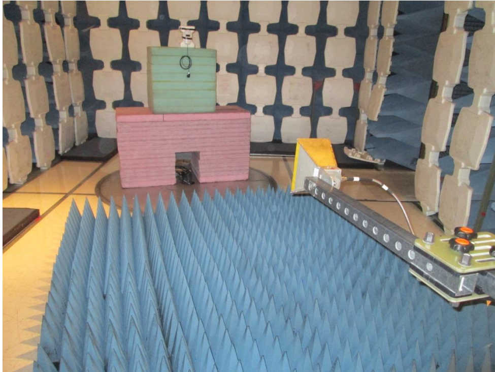
Radiated Emissions - 1 to 6 GHz