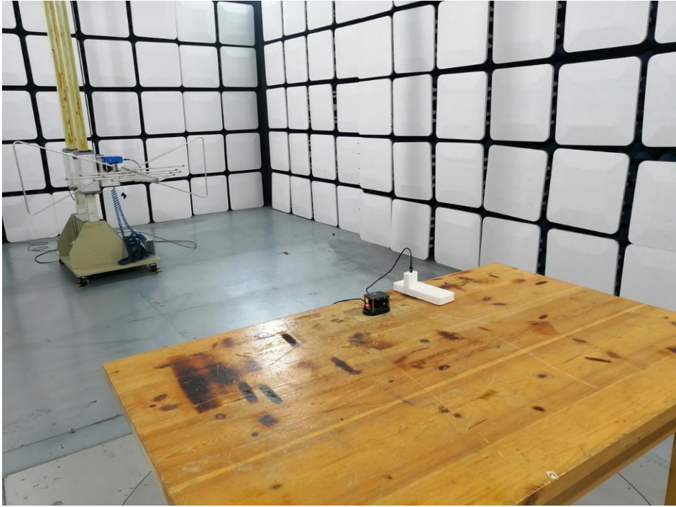
Photo of MPE Measurement