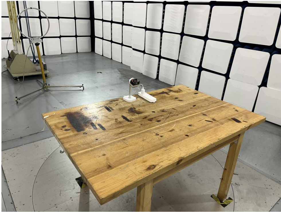
Photo of MPE Measurement