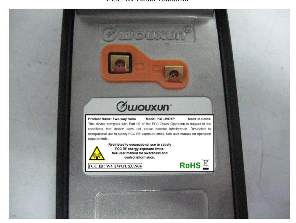
FCC ID Label Location