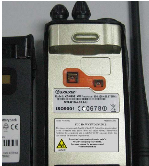
FCC ID Label Location