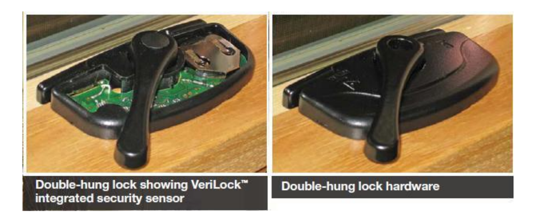
Figure 1 DH rev BB external battery up in situ.