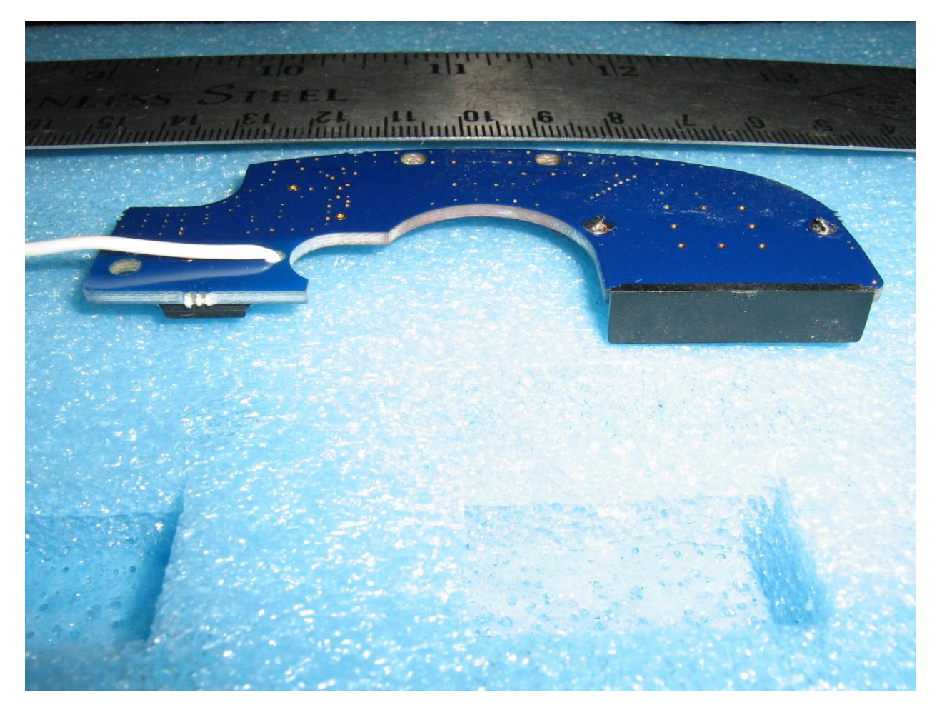
Figure 3 DH rev BB external battery down pcb with battery housing