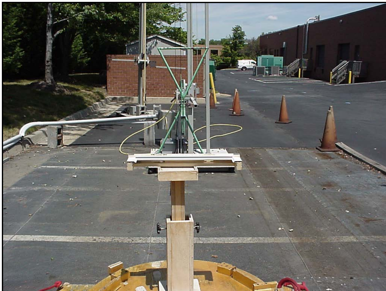
Photograph 3: Radiated Emissions – Back View