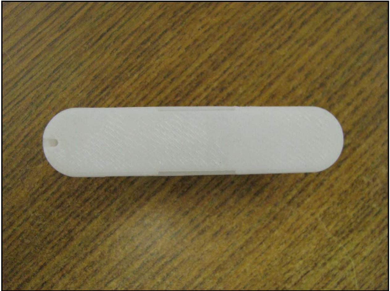
Photograph 3: Bottom View