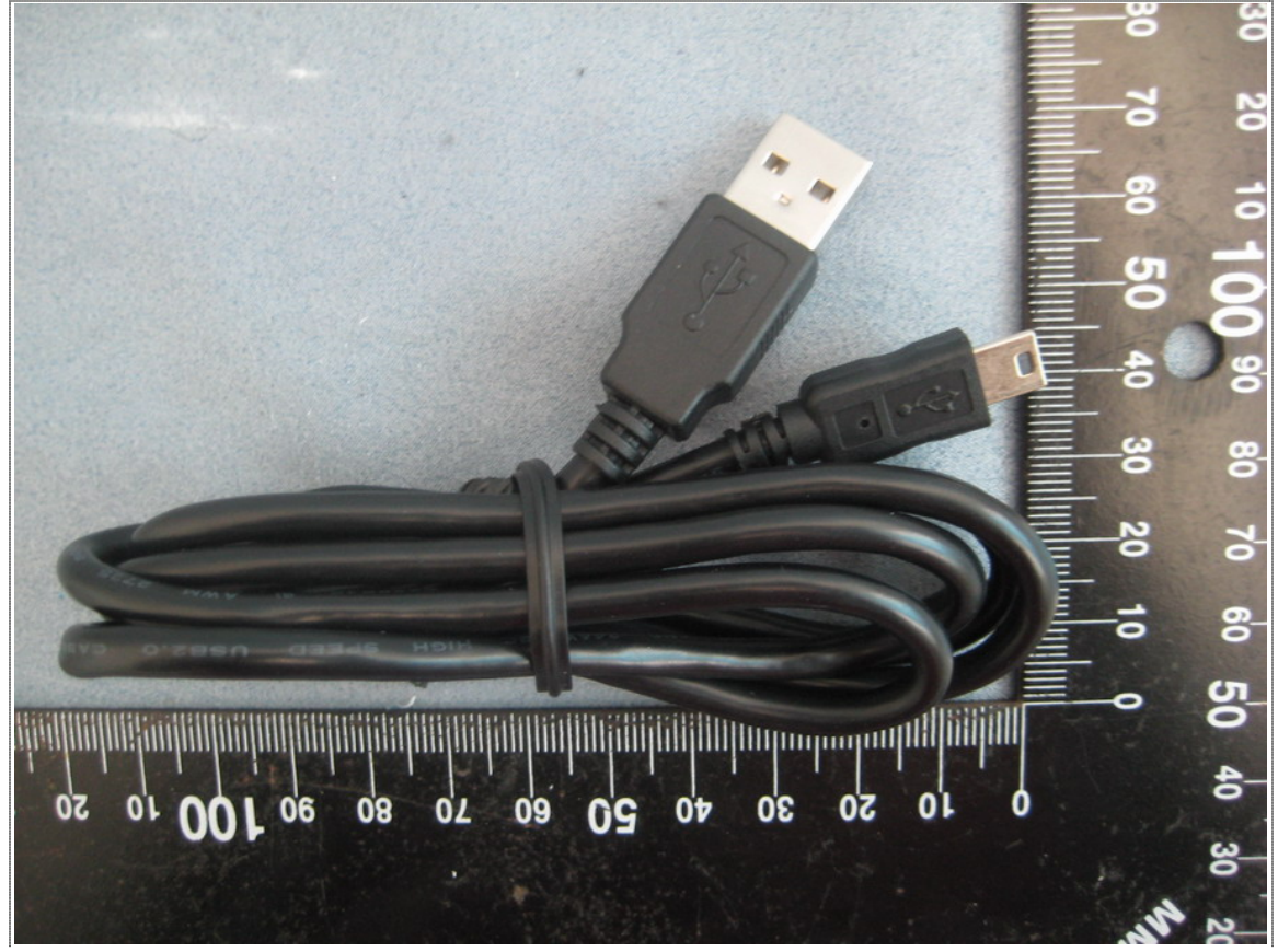
View of USB Cable