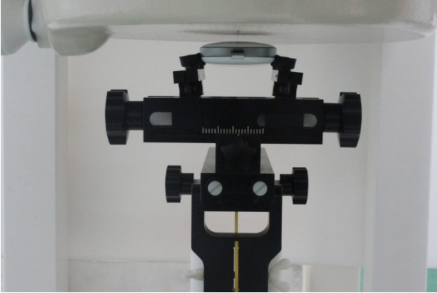
Front Face of the DUT with Phantom 10 mm Gap