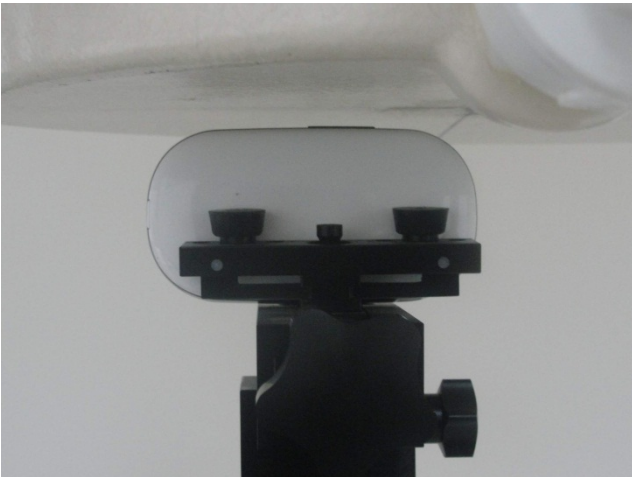
Right Side of the DUT with Phantom 10 mm Gap