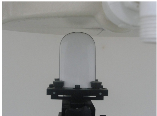
Bottom Side of the DUT with Phantom 10 mm Gap