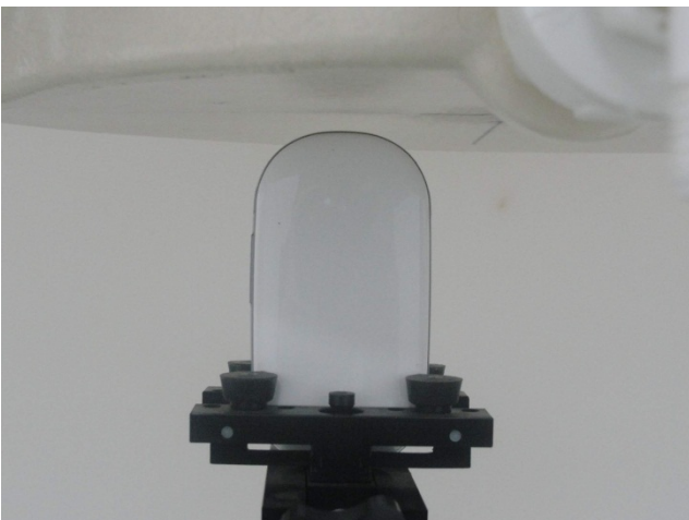
Top Side of the DUT with Phantom 10 mm Gap