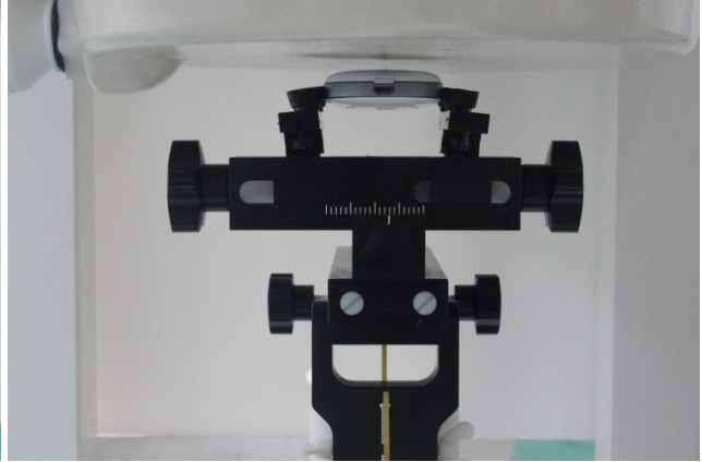
Rear Face of the DUT with Phantom 10 mm Gap