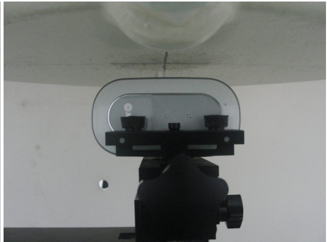
Left Side of the DUT with Phantom 10 mm Gap