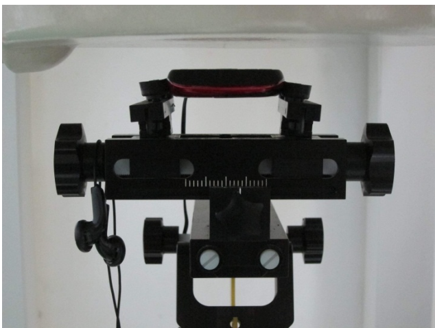
Face of the DUT with Phantom 1.5 cm Gap