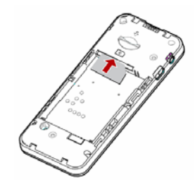
2.1.3 Install the battery and the back cover