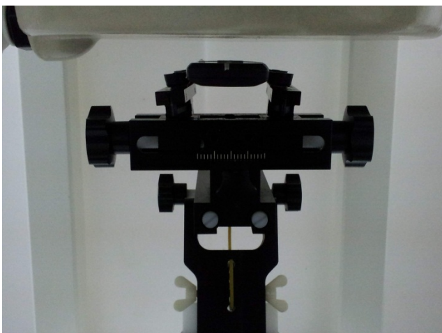
Front of the DUT with Phantom 1.5 cm Gap