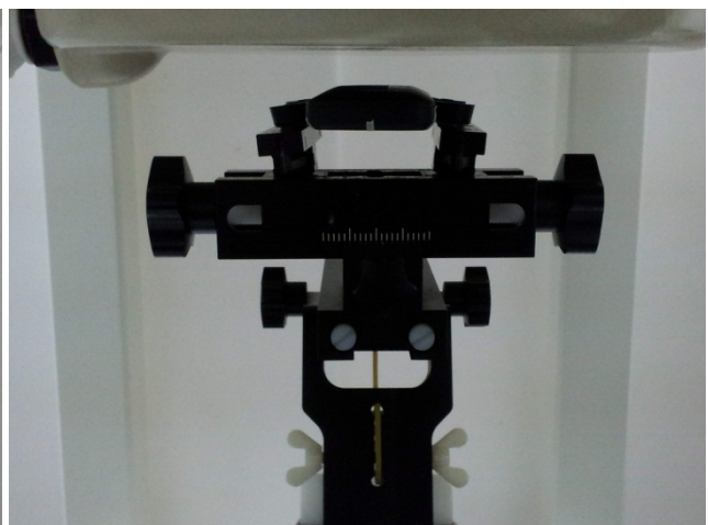
Back of the DUT with Phantom 1.5 cm Gap