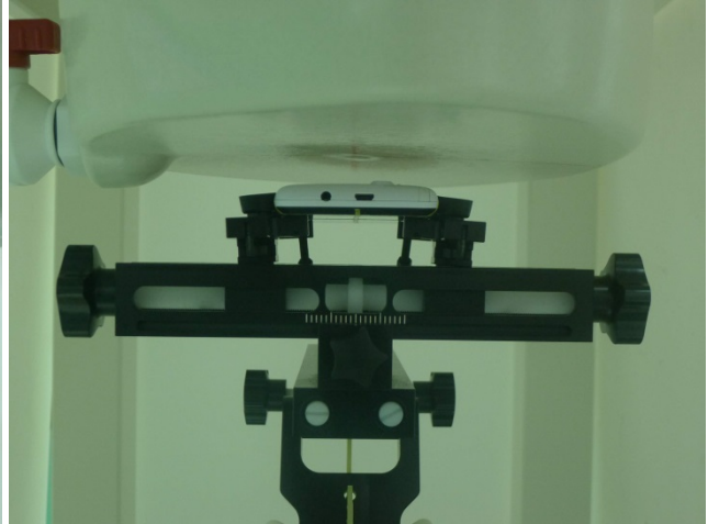
Back, Test Separation 1.5 cm