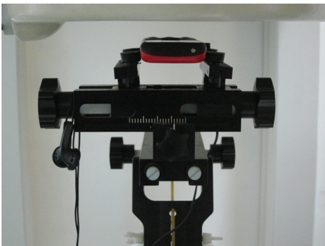
Face of the DUT with Phantom 1.5 cm Gap