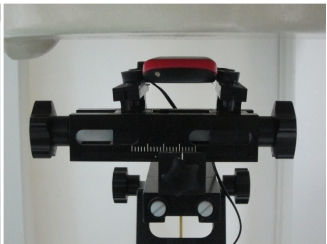
Bottom of the DUT with Phantom 1.5 cm Gap